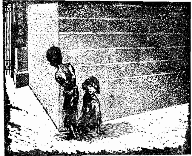
When father comes off shift . . .

The late Lu Hsun, China's great revolutionary writer, introduced the woodcuts of progressive West Euro-