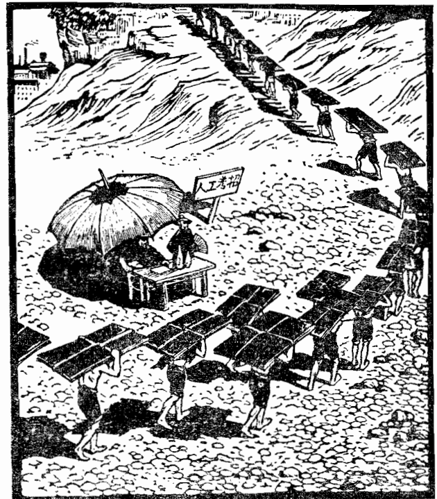
From "The Swindle"

pean and Soviet artists into China in the 1930s, and was one of the most energetic promoters of modern wood-engraving in China. Chinese modern woodcut art from its inception was dedicated to the service of the revolution. Since the liberation, woodcut artists have eagerly used their gravers to aid socialist revolution and socialist construction, and depict the people's struggle in other lands. The Szechuan artists, in these and other works, show themselves in the van of these endeavours.