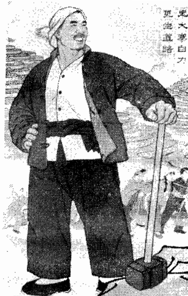
Posters calling on all to emulate the oil workers of Taching and the peasants of the Tachai Production Brigade who have demonstrated a splendid spirit of self-reliance