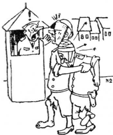
Wounded in action? No! We got beat up in Saigon. "Thong Nhat," D.R.V.