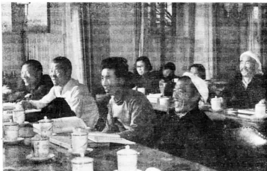
Deputies from Shansi Province in group discussion

Deputy Chen Yu, Governor of Kwangtung Province, spoke of the achievements of the people of his province in expanding the area of farmland producing high, stable yields. Efforts are being made to increase the area of such farmland all over the country so as to