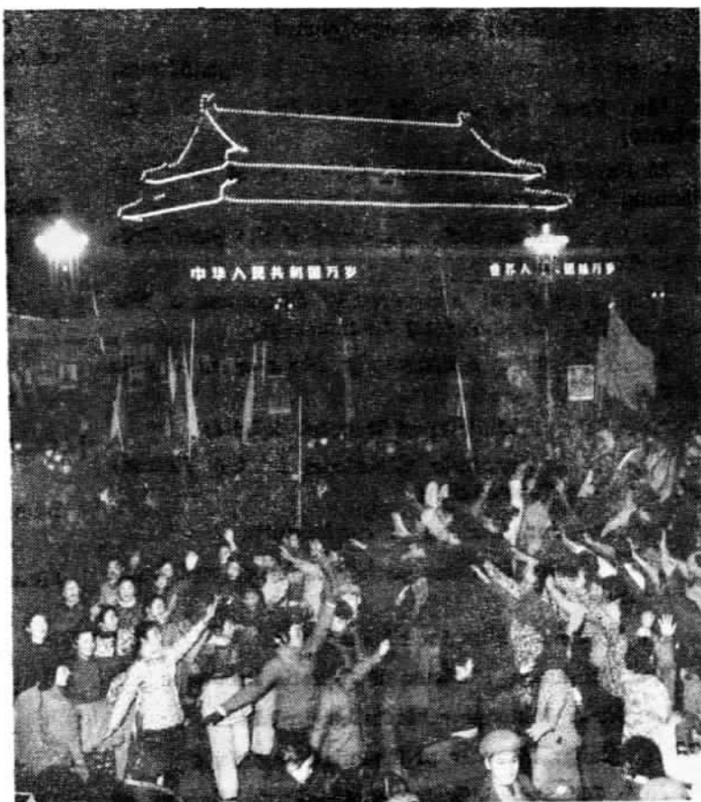
Peking cheers election of new state leaders in Tien An Men Square

People in the cities along the Yangtse River, including Wuhan and Nanking, paraded jubilantly at the