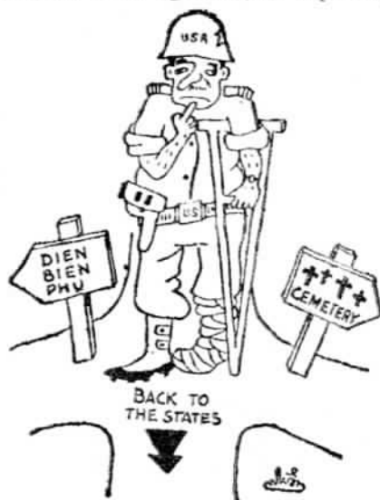
Don't know which way Johnson wants us to go.

These steps taken by the United States to escalate the war in south Viet Nam were exposed in the year-end communications between Foreign Minister Chen Yi and Prince Souphanouvong, leader of the Neo