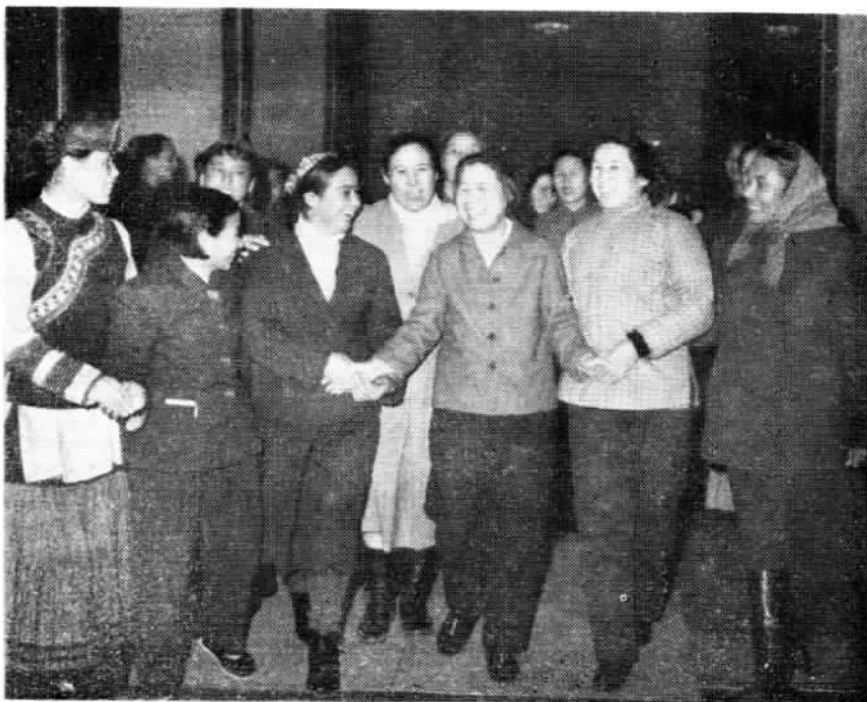
Teng Ying-chao, Vice-Chairman of the National Women's Federation of the People's Republic of China, meets women Deputies of different nationalities