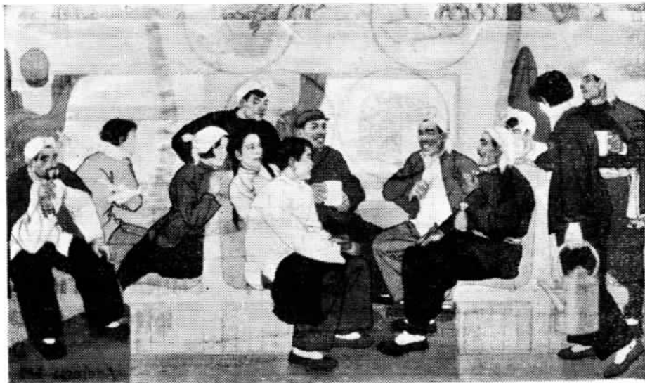
"Heroes on Their Way to the Conference"

The north China art scene, as this exhibition shows, is a very brisk one. Socialist life in the area in all its richness has provided the artists with their inspiration. Throughout the country, that same inspiration has given rise to other works which it will be a pleasure to see in the subsequent exhibitions of this series.