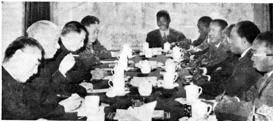
Chinese and Malian leaders confer

effective efforts in the cause of promoting Afro-Asian solidarity and defending world peace. "President Keita," the Premier said, "maintained a just stand at the Second Conference of Non-Aligned Countries; he has achieved positive results through his visits to several countries in Asia and Africa; he has taken a just attitude towards China's successful explosion of her first atom bomb. His outstanding activities and weighty expressions of opinion have won the warm praise and hearty admiration of the Chinese people and other peoples of Asia and Africa."