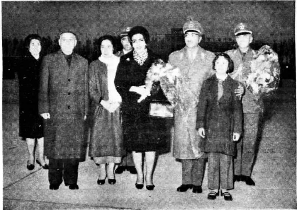
Their Majesties King Mohammad Zahir Shah and Queen Homaira with Chairman and Mme. Liu Shao-chi at the airport

The Kingdom of Afghanistan on the Central Asian plateau is a country with an ancient civilization. Its people love freedom and independence above all else. The Chinese people greatly admire the heroic spirit displayed by the Afghan people in combating colonialist incursions between the 30's of the last and the beginning of this century. In recent years, the Kingdom of Afghanistan, under the leadership of His Majesty King Mohammad Zahir Shah, has made great efforts and has had marked success in developing its national economy and culture and promoting social progress. And it was the leader of this freedom-loving people whom China was welcoming.