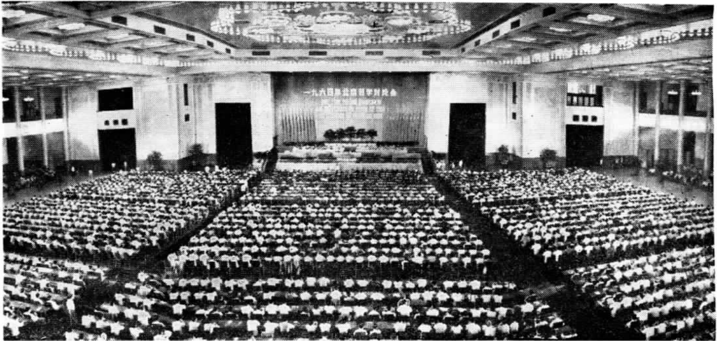
Opening ceremony of Peking Symposium