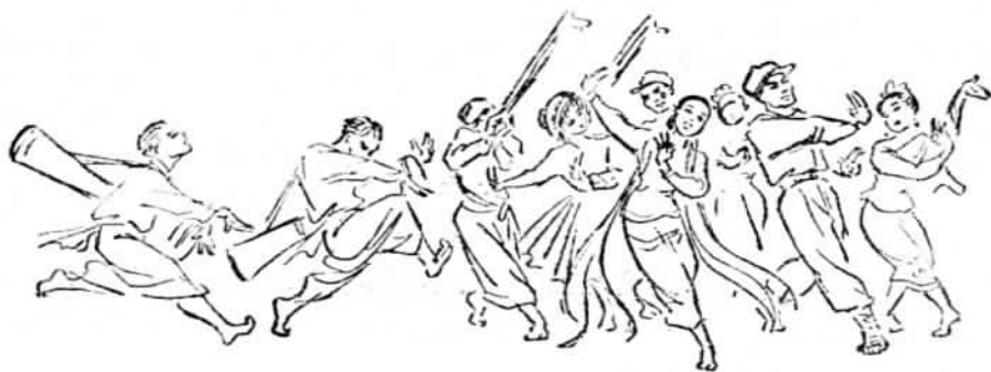
"Dance of Victory"