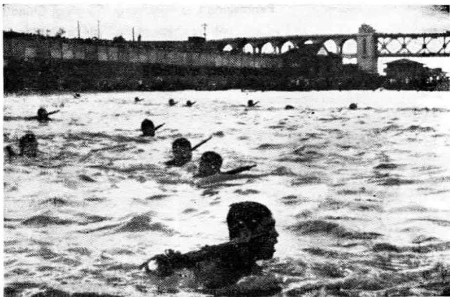
Militiamen crossing the Yangtse at Wuhan. The great Yangtse River Bridge is seen in the background

The people's militia have an extra reason to take to the rivers. In Lushun-Talien, 150,000 men and women took part in one people's militia military exercise in the sea. In Hangchow, 2,800 militiamen swam across the 1,000-metre Chientang River. At the starting point under the famous Liuho Pagoda, huge red streamers carried the words "Support the Vietnamese people's just fight against U.S. aggression and in defence of their fatherland!" and "Temper revolutionary will in the winds and waves!"