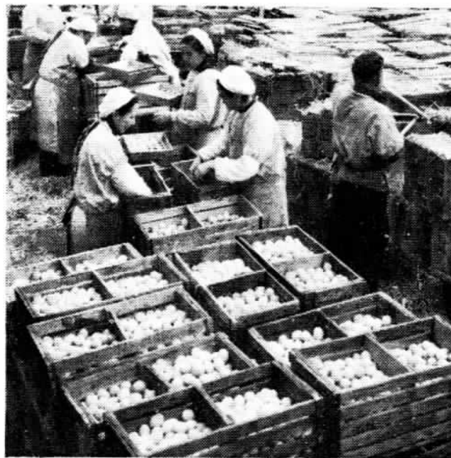
Inspecting and getting eggs ready for market

AS far back as 300 A.D. Chinese literature recorded the deliberate use of insects to fight crop-destroying insects. Citrus ants helped growers of citrus fruits 1,600 years ago. Like gunpowder and the compass, however, the development and wider application of such practices were stifled by reactionary rule. Unlike the past, Chinese scientists today engage in the search for more living insect-killers and how best to use them.