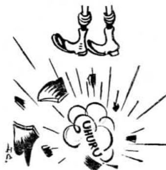
A tough continent