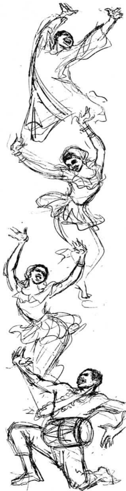
Sketch by Li Ke-yu

Radio and television gave full coverage to the week's commemorative activities. The Central Broadcasting Company's chuyi troupe put on a number of new works among them a scintillating cross-talk dialogue Africa Marches to Independence , and Hold This Rifle , The Story of a Little Black Girl , Battle Drums and A Letter to African Seamen performed in various chuyi styles. There were special TV programmes for young viewers. Peking primary school children contributed a choral singing of Our Country Is in Black Africa and other songs.