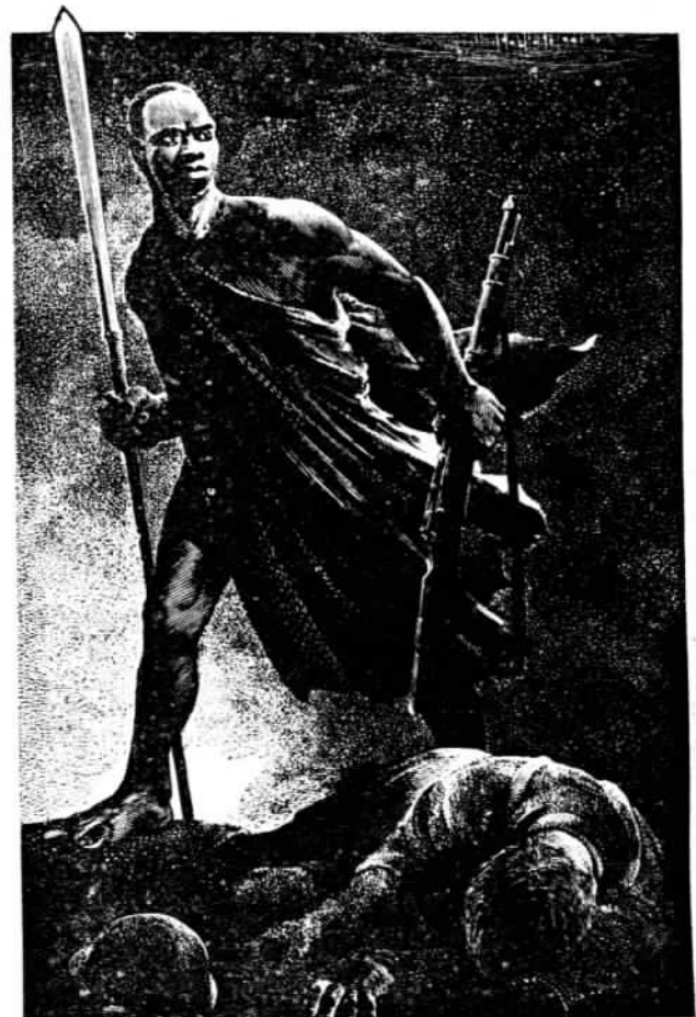
Thunder out of Africa

Because of this the imperialists and colonialists exert great efforts to suppress and smash the African national-democratic movement. They carry out widespread bloody massacres, suppression and persecution against those striving for independence. For those countries which have won independence, they resort to tactics of neo-colonialism — political, military and economic manipulation and control as well as cultural