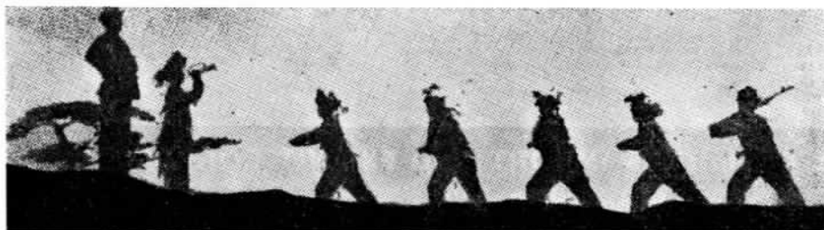
From the dance-drama "Field Training" presented by a P.L.A. ensemble from Canton

Volleyball Teams Visit Japan. China's men's and women's volleyball teams visited Japan from March 18 to April 8 and each played nine matches in Tokyo, Apporo, Nagoya, Kyoto, Hiroshima, Saga and Fukuoka. The men won three of their matches and the women, one.