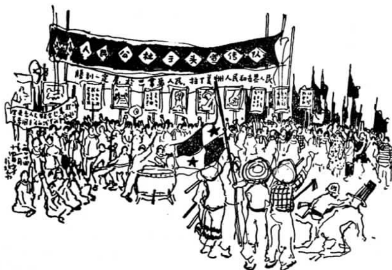
An amateur troupe performs a skit on Yankee imperialism

Greeting these manifestations of the firm resolve of the Panamanian people to carry on the struggle until final victory, Renmin Ribao in its January 20 editorial declared: "The Chinese people express boundless admiration for the Panamanian people's fearless spirit. China's 650 million people pledge themselves to stand squarely behind the Panamanians." The despotic behaviour of the U.S. imperialists in disregarding Panama's sacred sovereignty and national dignity was intolerable to any nation with self-respect, it said. "U.S. imperialism has exposed its ferocious features in Panama. This once again teaches all Latin American countries that U.S. imperialism will never abandon its colonial interests in Latin America, nor will it ever treat them as equals. It would be pure illusion for anyone to think that U.S. imperialism would give up its vested interests in Latin America." Expressing confidence that the Panamanian people's just demand would surely be