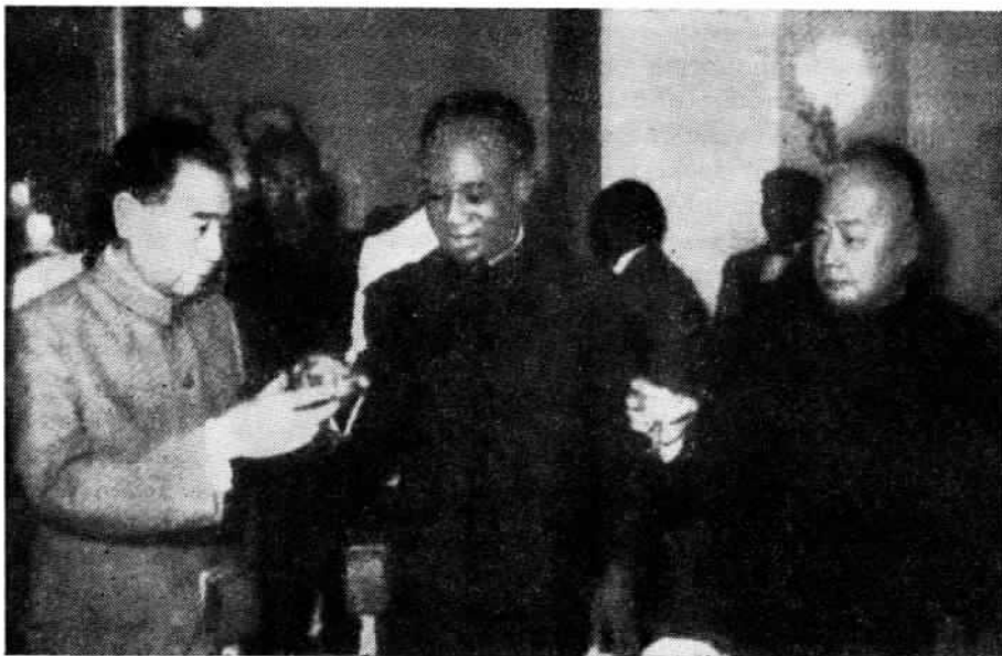
Premier Chou En-lai (left), President Nkrumah (centre) and Vice-Premier Chen Yi at the state banquet given in honour of China's Premier

The cheers of "Welcome! Welcome!" and "Chou En-lai!" were punctuated by the rhythmic chant of "Ya, ya — Ya, ya!" — traditional expression of welcome to distinguished guests — shouted by the smiling crowds. The most loudly shouted slogan was "Freedom! Freedom!" These cries came from the heart of the people where true friendship lies; they were heartfelt greetings from a