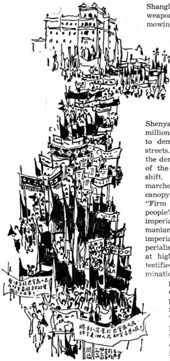
Mass demonstration in Peking

firm support of Shanghai's working class for the Panamanian people. Said she: "United in their struggle and with the support of the world's people, the Panamanian people will surely defeat all U.S. schemes and brutal acts of aggression and regain sovereignty over the canal zone."