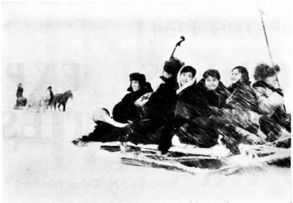
To make music in a snowbound village

Picture-Story Book Contest. The Union of Chinese Artists announced the results of a nationwide picture-story