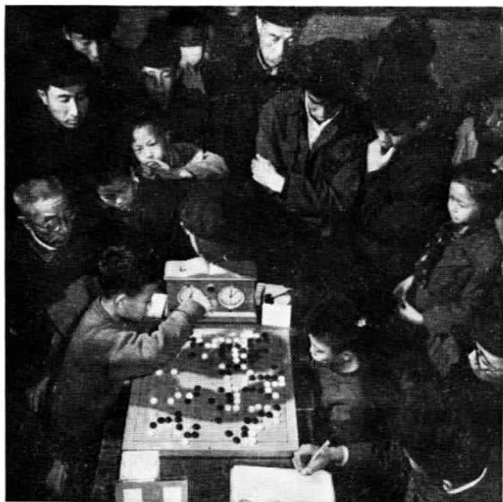
An absorbing match