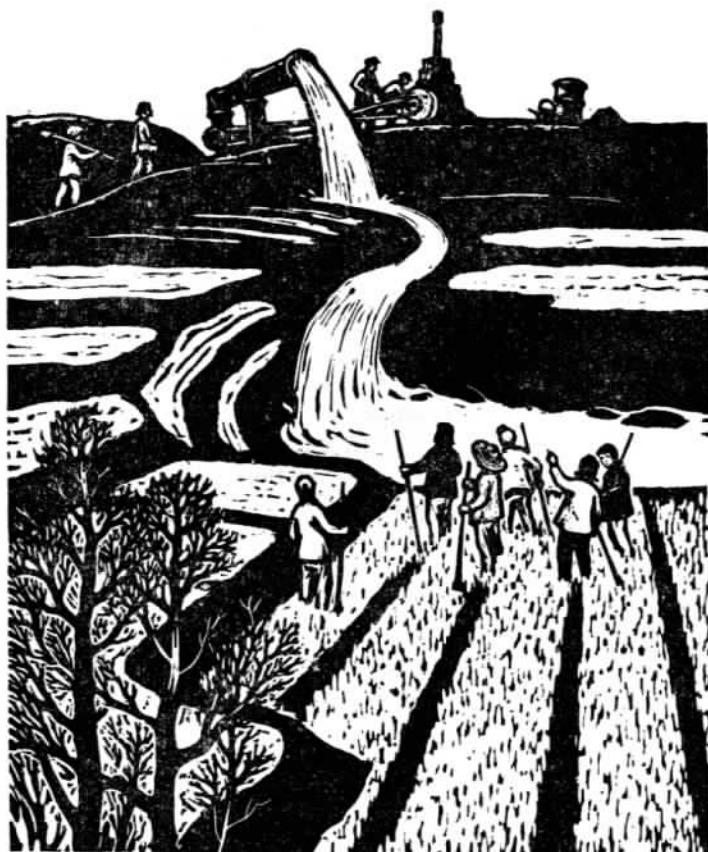
Watering the Fields