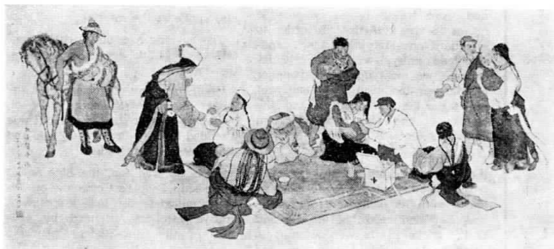
Baby Care in Tibet

Communist Party and People's Government. Since 1959 when the rebellion by the handful of Tibetan reactionaries was quelled, the People's Government has allocated more than 13 million yuan for the promotion of health and medical services in the region. Nearly 1,000 doctors and medical workers have come from other parts of the country to work in Tibet, while hundreds of Tibetans have gone to study in medical institutions in Szechuan and other provinces.