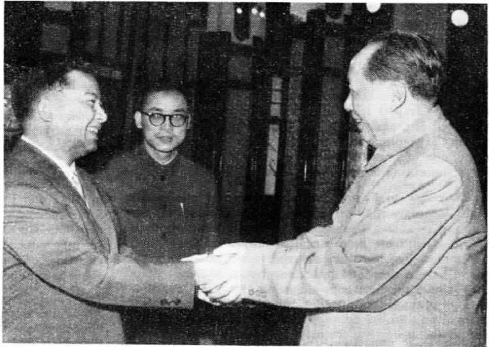
Chairman Mao greeting Prince Norodom Sihanouk

First, the friendship which exists between China and Cambodia is one of rapid development. Drawing attention to this point, Chairman Liu Shao-chi in his speech at the state banquet stressed: "The Chinese and Cambodian peoples have always lived in friendship, but never have they been so friendly as now." He expressed confidence