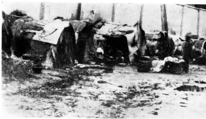
Mat sheds in a pre-liberation Shanghai slum

The former slum areas have taken on a new look. The puddles have been filled up and sewers put in. Roads have been made and surfaced with gravel or asphalt. The mat sheds are no more; large numbers of adobe huts have been replaced by new brick houses. Newly planted trees and flower beds have transformed the whole aspect of the place. In Chapei, once one of the worst slums, new 4- and 7-storied apartment houses have gone up.