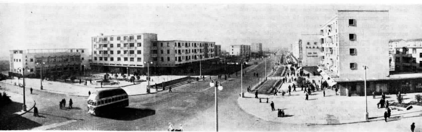
The new Changmiao residential district in northeast Shanghai, built in 1960

sufficient distance to keep the residential districts free of soot.