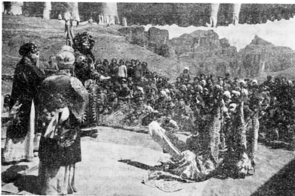
An open-air Honan opera performance on a local hillside