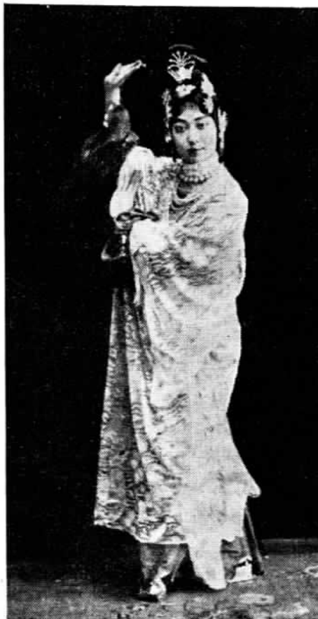
As the Nymph of the Lo River (1936)

The cultural influence of his uncle's family was, though conservative, good. From childhood he learnt to be polite, gentle, honest and considerate. He was also trained under strict discipline in the fundamental elements of dramatic art. This early education stood him in good stead in his later career. Early in life he decided to follow in his grandfather's footsteps and aspire to the heights of his chosen art. He learnt to hate evil and oppression and cherished a ready sympathy for the poor and honest people. In portraying virtuous but down-trodden women on the stage, he was at once able to convey to his audiences a profound feeling and sympathy for the char-