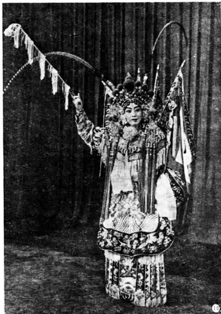
Mei Lan-fang at the age of 65 as Mu Kuei-ying in "Mu Kuei-ying Takes Command"

The Japanese invaders, their puppets and venal theatrical managers saw in Mei Lan-fang's privations a great opportunity to induce him to return to the stage. They wheedled and begged him repeatedly to give a performance. "Mr. Mei," said one of the managers who had made a fortune out of Mei Lan-fang's past performances, "if you will give just one performance any amount of money is yours for the asking. . . . Just say one word—'Yes'—and thousands of dollars will be given to you at once for your daily expenses." To set his mind at rest about being unpatriotic they added: "You will be performing for the Chinese people and not for the Japanese. What's wrong about a Chinese acting for the Chinese people?" Mei Lan-fang was extremely hard up at the time and his poverty was not a matter concerning himself alone. He had a big family to support and the members of his troupe had to support their