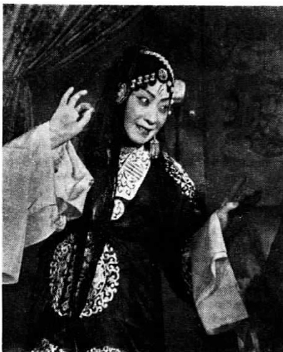
As Chao Yen-jung in "Beauty Defies Tyranny" (A post-liberation picture)

In 1913 Mei Lan-fang made his first stage appearance in Shanghai. During his stay there he met progressives in local theatrical circles and his stage practice underwent a change as a result of their influence. When he returned to Peking, he began to widen the scope of the social themes treated in his plays more consciously to awaken and enlighten the people. It was at this time that he produced Waves of the Evil Sea , Ups and Downs in the Official World , One Strand of Hemp , Teng Hsia-ku and other plays in what was at that time called "modern-costume" style. In these plays he sought to expose the evils of officialdom, to oppose the evils of feudal marriage specifically (it should be remembered in this connection that Mei Lan-fang specialized in the tan or young women roles of Peking opera) and arouse sympathy for the common people.