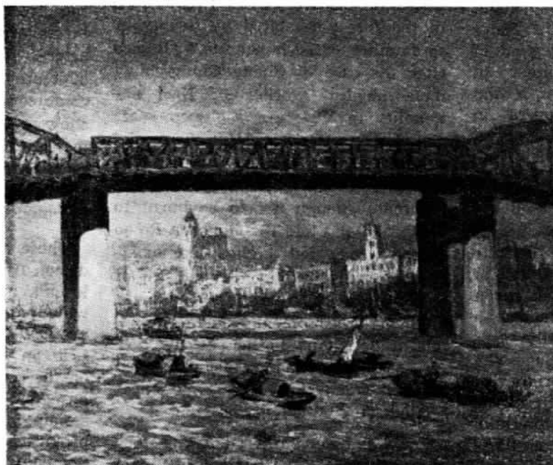
On the Pearl River

As a child—he was born in 1905—Yu Pen early had a love for art, but living then in Canada, circumstances dictated that he had to start work for a living very