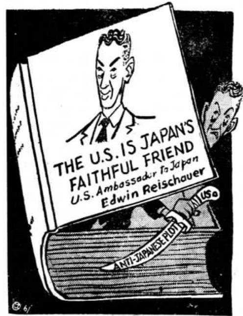
Behind the Beautiful Cover

The American eagle, said Kennedy in a message to Congress, symbolically holds arrows in one talon and an