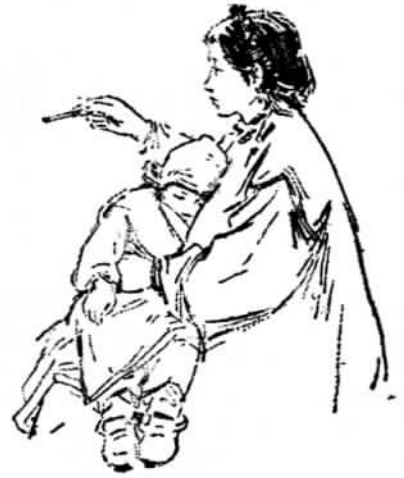
In the Clinic Sketches by Niu Wen and Li Huan-min

getting a firm grasp of their jobs. Today, the overwhelming majority of cadres at levels below the county are Tibetans who have just come forward from the ranks in the localities where they serve. In the Lhasa area, for example, 90 out of 106 county heads, deputy county heads, district heads and deputy district heads, that is, 85 per cent, are Tibetans. Cadres of Han and other nationalities