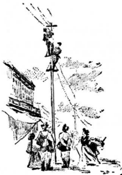
Putting Up Power Lines

Improvements have been introduced in tilling techniques and field management too and more fertilizer has been put onto the fields than ever before.