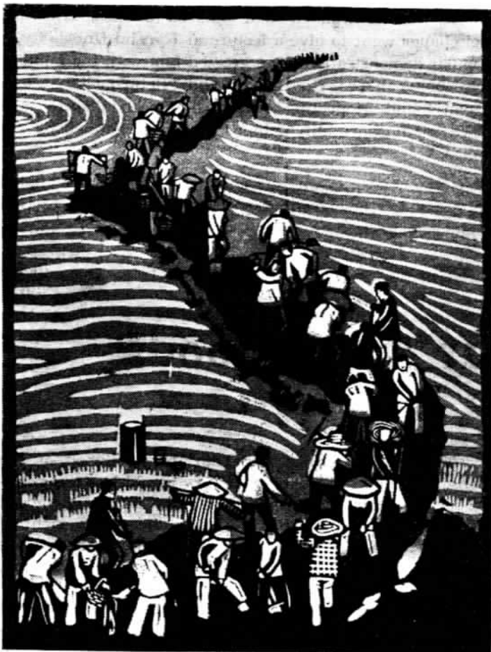
Digging an Irrigation Channel Woodcut in colour by Yo Lung

One of the biggest joint efforts of the brigades was on the four basin areas which account for the greater part of the commune's farmland. Here timely planting of the winter wheat is vital to a good summer crop the following year. "Timely" here means ploughing and sowing immediately after the waters have been drained off in the autumn, otherwise the silted soil gets baked hard as slate in a few days. This posed quite a problem for those brigades which suffered from heavy waterlogging and lacked manpower and draught animals.