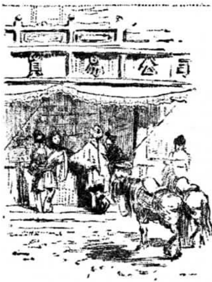
Customers from the Countryside

The training of cadres, particularly from among the Tibetan people, is important for staffing and perfecting state organs at all levels to meet the requirements of rapidly growing production and construction. This work has always received a great deal of attention. Long before democratic reform began, large numbers of young Tibetans were sent to study at the central and local institutes for nationalities,