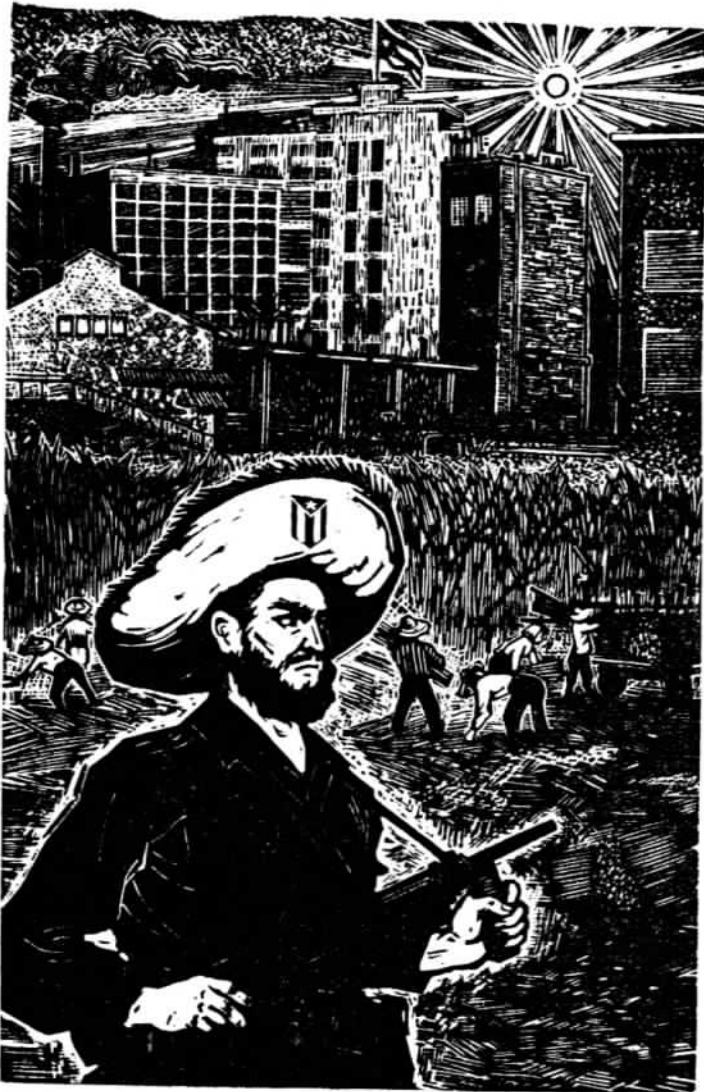
Cuba on Guard!