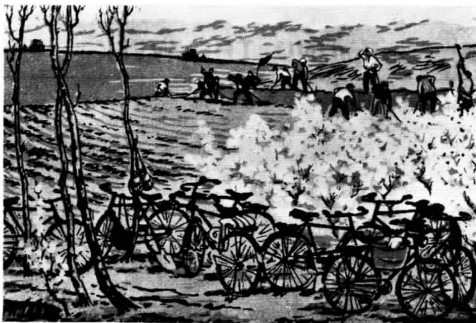
Commune Team and Their Mounts