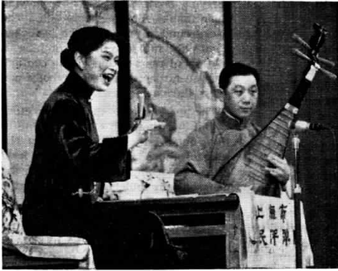
Two pingtan ballad artists

your eyes are rivetted on the performers."