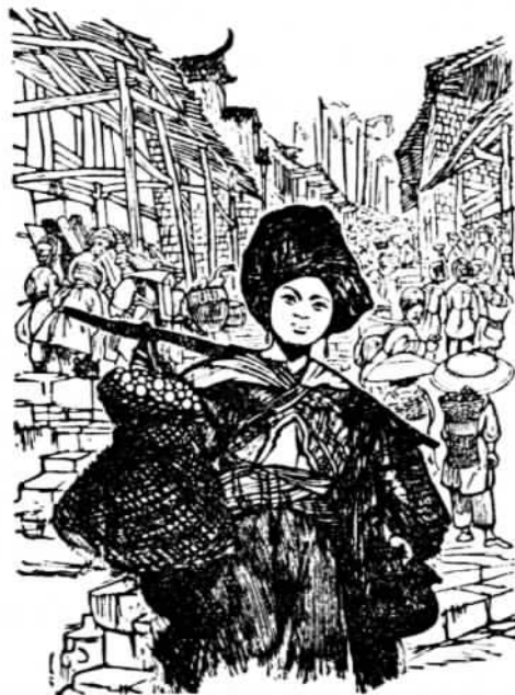
At the Fair Woodcut by Huang Yung-yu