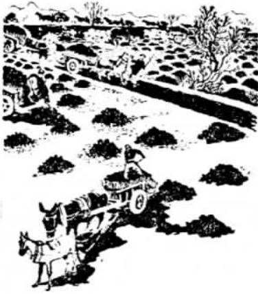
Bringing Fertilizer to the Fields