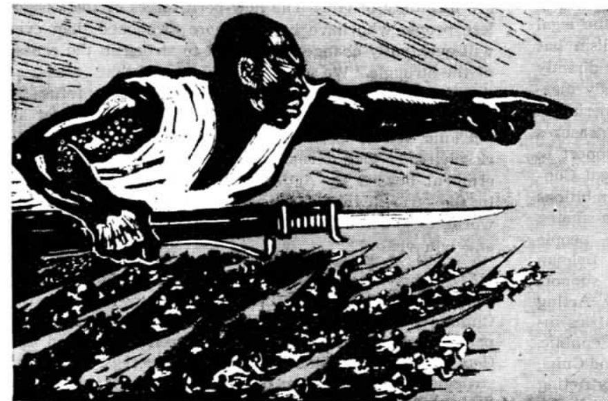
Drive the Colonialists, New and Old, Out of Africa!

Public feeling on this crime has been expressed in print, pictures, poems and the cinema. The press has given extensive coverage to the news. Its editorial comments have been supported by accounts of Lumumba's life, translations of his poetry deeply inspired with patriotic feeling, news photos of protest demonstrations