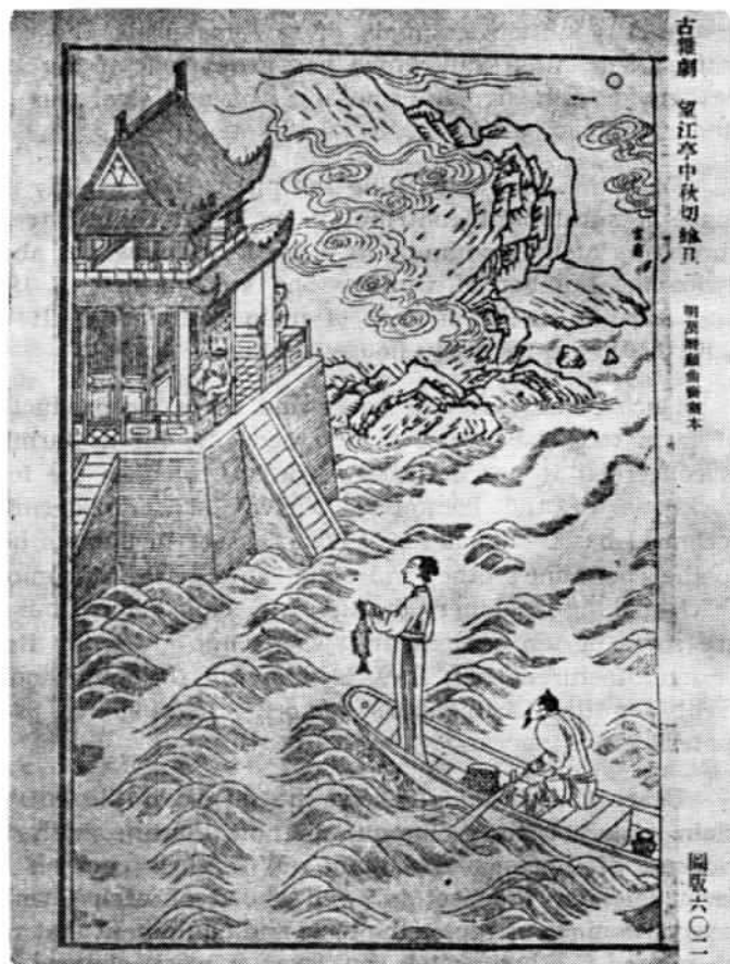
Illustration to "Wang Chiang Ting" ("The Riverside Pavilion"), an opera by the great 13th century dramatist Kuan Han-ching. This wood-block print, from a 16th century edition, is an outstanding example of the graphic art of that time

Woodcuts in colour represented a further advance in the technique of wood-block printing. The process of development is well illustrated in the collection. In order to make the facsimiles as faithful to the originals as