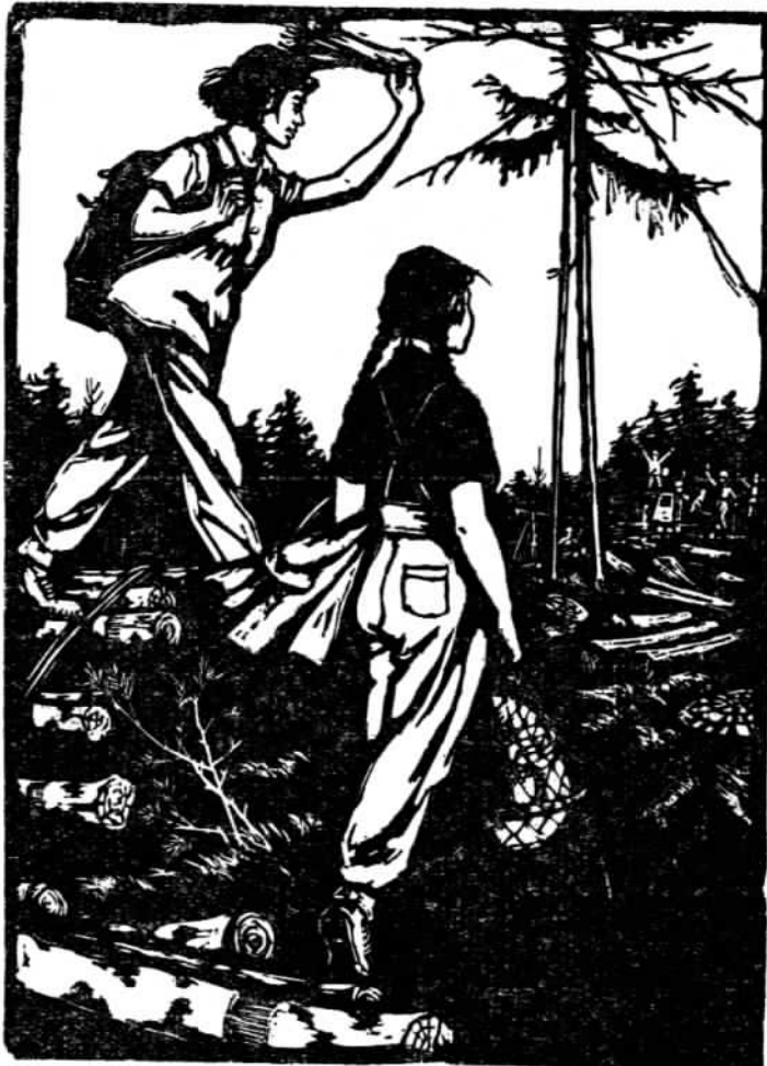
To Where the Nation Needs Them Most!

The irresistible rise of the national independence and liberation movement in Asia, Africa and Latin America is shaking the very foundations of imperialism. In their panic and desperation to bolster the tottering colonial system, the imperialists lash out in savage fury against those journalists who write the truth in the interest of justice and human progress. Chinese journalists and those of the other socialist countries, along with their progressive colleagues throughout the world, stand by to give aid and full support to fellow journalists bearing