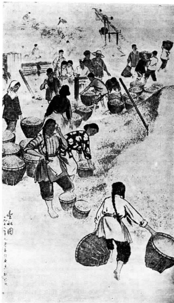
To Fill the Barns of the People's Commune

Painting in Chinese ink and colours by Wei Tzu-hsi