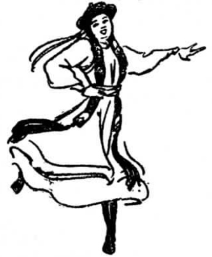
Ulyankhai Dance Sketch by Li Ke-yu

The artists of the Khobdo Aimak Art Troupe from the Mongolian Altai Mountains left a deep impression on their Chinese audience. The beautiful undulating tunes of the matouchin (two-stringed Mongolian national in-