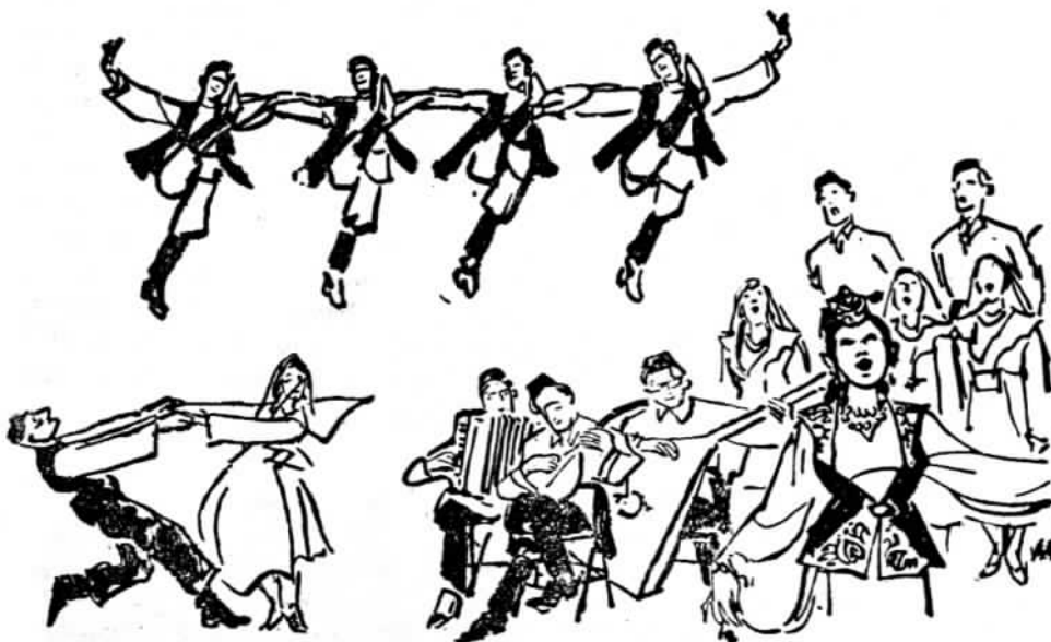
Sketches of the Soviet Tatar Ensemble by Yeh Chien-yu

In the past few years, visiting Mongolian artists have sown fertile seeds of friendship in China. Mongolian acrobatics, folk dances and the