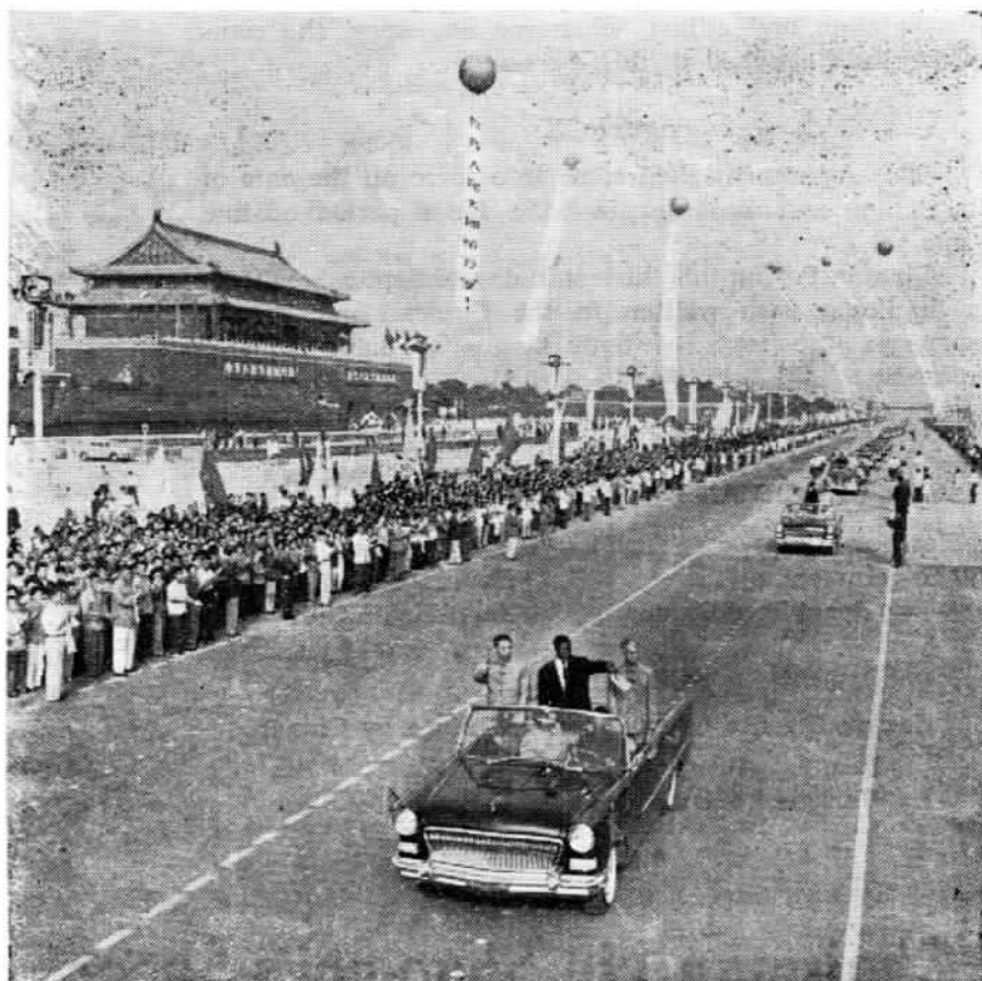
500,000 Peking citizens turned out to greet President Toure upon his arrival. The scene as President Toure, accompanied by Chairman Liu Shao-chi and Premier Chou En-lai, crosses Tien An Men Square.

as the common enemy of all peace-loving countries and people of the world. We are deeply convinced that so long as the peoples of Asia, Africa, Latin America and the rest of the world further unite, maintain high vigilance and constantly expose the diverse schemes of imperialism, and wage resolute struggle against them, these schemes will certainly meet with complete defeat.