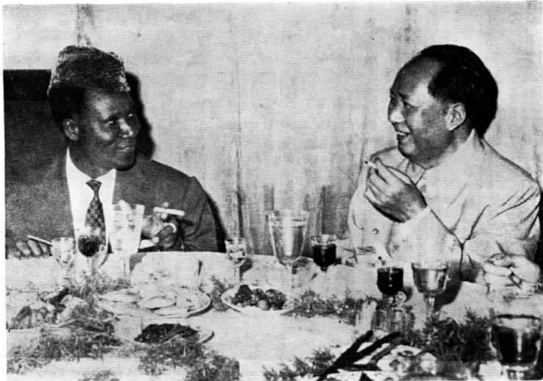
On the evening of September 12, Chairman Mao Tse-tung gave a banquet in honour of President Sekou Toure.

President Sekou Toure in his current visit to China has conveyed to the Chinese people the intimate and cordial friendship of the Guinean and African peoples, and will also take back to them the deep feelings and friendship of the Chinese people. The imperialists are hostile to the friend-