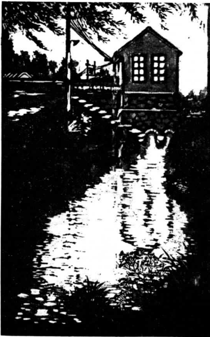
A Small Rural Power Station