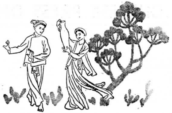
Third brother and his wife in the "Magic Water Bottle"

The Vietnamese hat cheo opera dating back to the 14th century is an operatic style with a strong national flavour. The themes of its repertoire for the most part reflect the aspirations, thoughts and feelings of the working people—their love of truth,