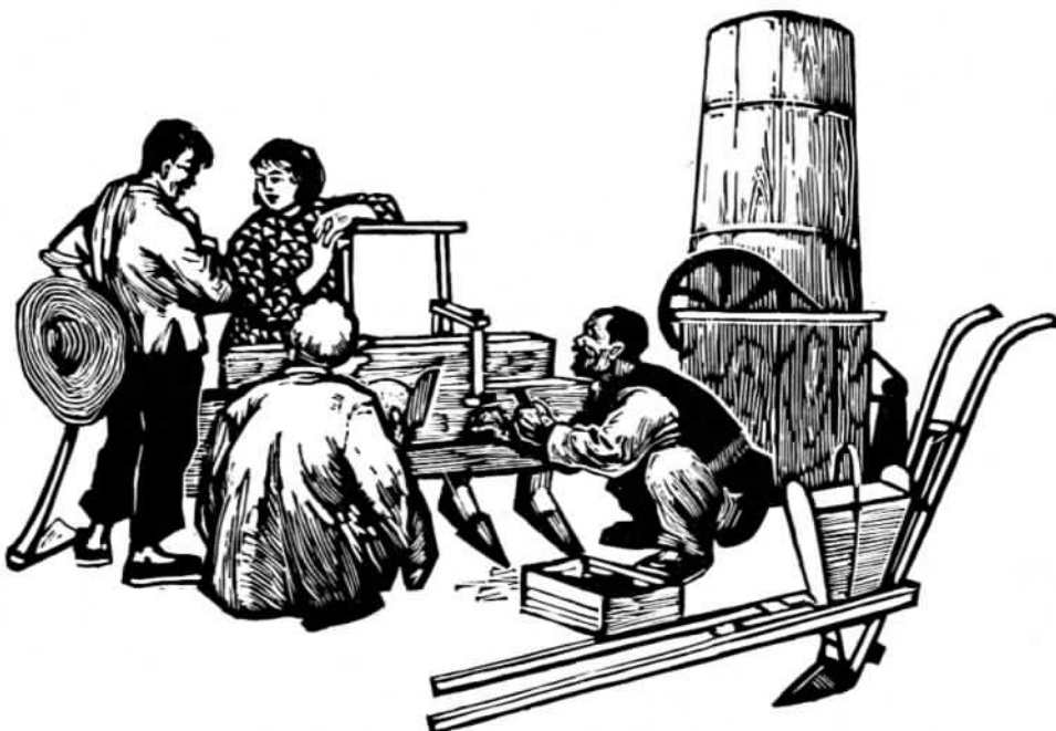
Workers Helping Peasants to Make New Farm Implements