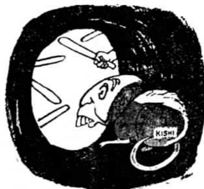
Cornered! Cartoon by Fang Cheng

For all these crimes and his responsibility in bringing about the war, Kishi was sent to Sugamo prison as a Class A war criminal in 1945. He escaped further punishment and was released by the U.S. occupation authorities when they found they could use him as a tool to perpetuate their rule over Japan.