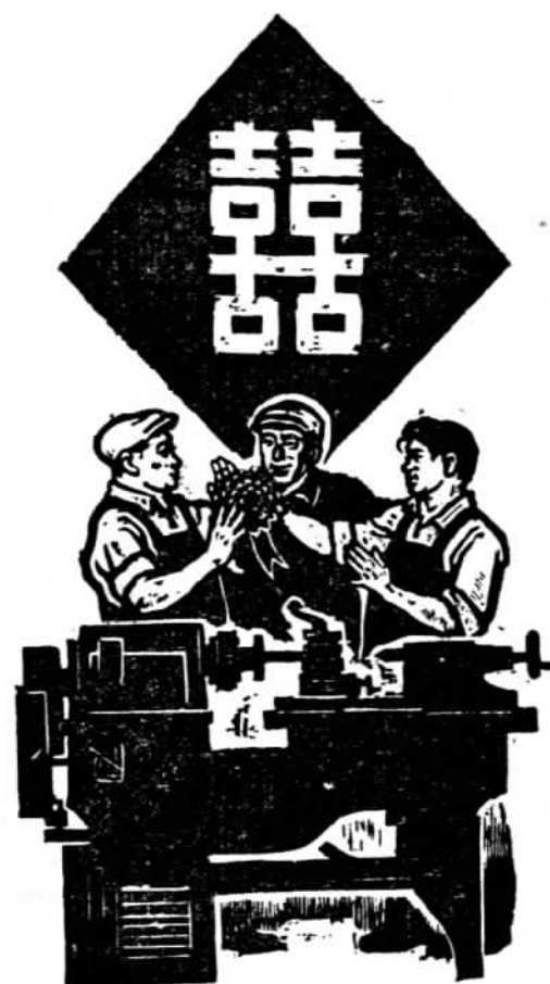
Technical Innovation Woodcuts by teachers and students of the Lu Hsun Art Academy's Graphic Department

Ninthly, it is a movement that is integrated with ideological revolution. Through socialist and communist