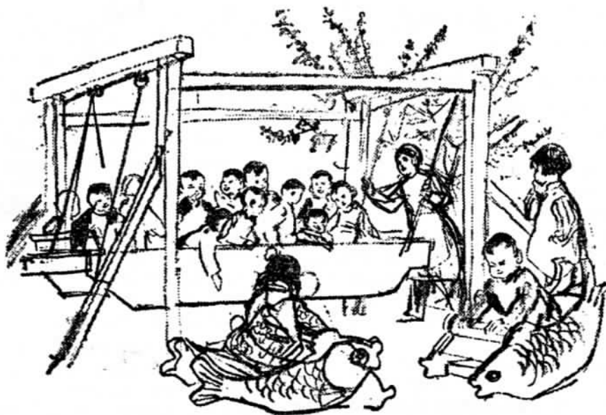
Children Playing in a Chunshu Kindergarten

All these organizations serve and maintain close links with production, whose steady expansion is the best guarantee for their constant improvement. Not intended to run at a profit, the charge for all services is reasonably low. As a matter of fact, they are partly sustained by subsidies from the accumulation fund of the commune.