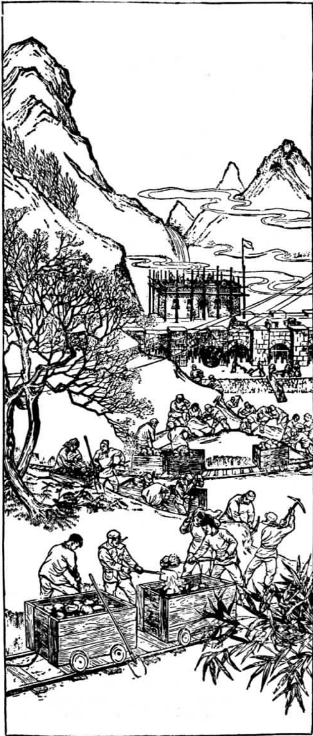
A Commune Builds Hydro-electric Power Station