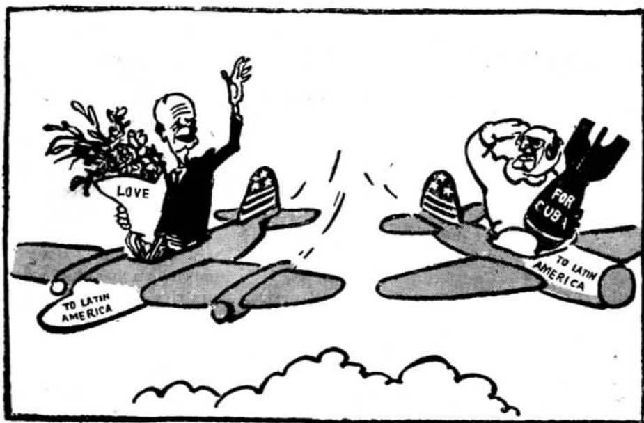
Division of Labour

U.S. imperialism, however, has plagiarized this slogan and distorted it for its own purposes. Thus the U.S. brand of Pan-Americanism is not a slogan to rally the Latin American peoples for the defence of their national interests, but a device through which to manipulate them according to U.S. dictates—in short, a means to make Latin America an adjunct of the United States. U.S. imperialism has set up a host of organizations to "handle" the Latin American countries under the