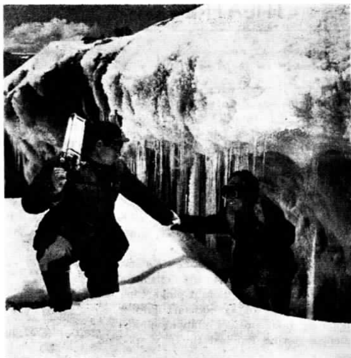
Surveying the glaciers

In 1958, based on the experience of the local peasants, the joint research team of the Chinese Academy of Sciences conducted several experiments on glaciers and snow mountains 4,500 metres above sea level. Charcoal powder and loess dust were sprayed over a small area of ice- and snow-covered land. The results of the experiment established that every square kilometre of "blackened" glacier released an extra 10,000 cubic metres of water from surface melting in every 24 hours; that the artificial "blackening process" to accelerate thawing is feasible when the air temperature is not lower than 5°C. below zero or the temperature of