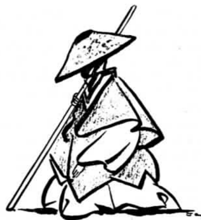
The fugitive in "The Contribution Book"

in Benkei's dance of victory as he goes in triumph down the Flower Path, over the heads of the audience, to the exit.