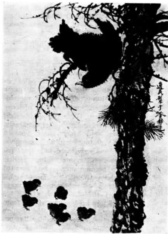
Chicks and Eagle Painting in Chinese ink by Li Yi-min

work and composition that can well stand comparison with that of a matured professional, he retells the tale.