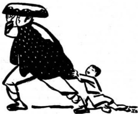
Kan'emon Nakamura in "Sakura Sogoro"

In The Contribution Book , Chojuro Kawarasaki gives a classical performance in the role of Benkei. Both Chojuro and Kan'emon act in the grand tradition, masters equally of the small, meaningful gesture, a glint of an eye, a nod of the head, or of the sustained expressive dance episode as