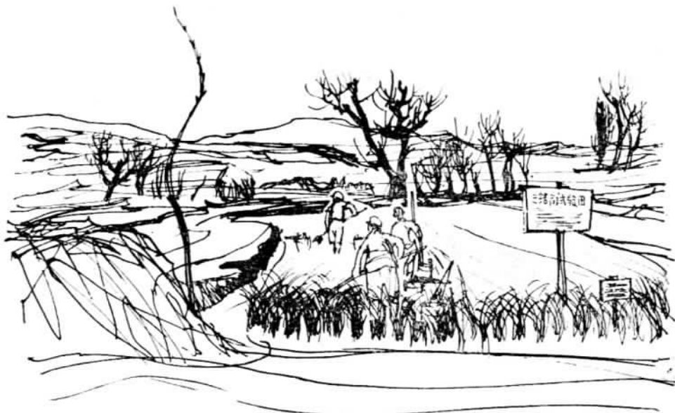
The experimental plot

With this encouragement Wang Pao-ching regained confidence. Together with Wang Chung-hai, a young peasant, and Yao Sheng-chih, an old peasant with decades of experience behind him, both members of his mutual-aid team, a concrete plan of experiment was worked out. Their analysis showed that the root-cause of the district's low maize yield wasn't only a matter of poor soil, as was alleged, but of defective farming methods in general and the inferior variety of maize they sowed in particular. On a plot of 1.7 mu they introduced close planting, the application of more fertilizers and a different way of watering. As a result that year they reaped