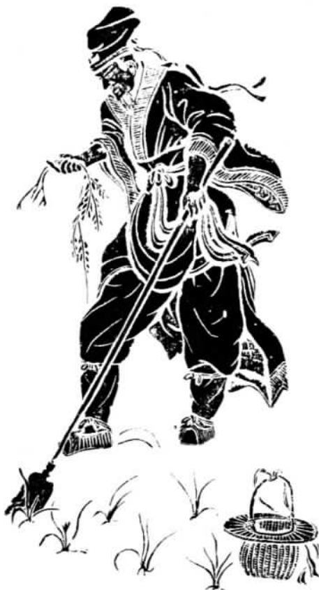
Li Shih-chen, China's great 16th-century pharmacologist, gathering herbs for traditional Chinese medicine