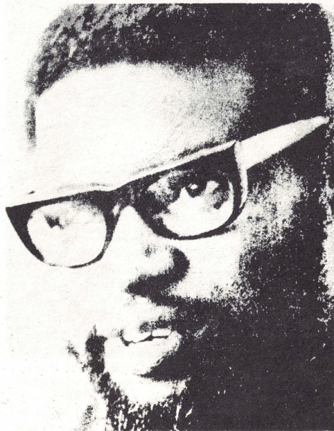
SWAPO President Sam Nujoma.

As announced in the last issue of LSM NEWS , LSM has recently launched an international campaign to meet SWAPO's request for a complete printshop. We have begun raising funds to purchase and send full printing equipment and supplies to SWAPO, and to send two cadre to help train six SWAPO members in the techniques of offset printing. We estimate the total cost of the project will be $20,000.