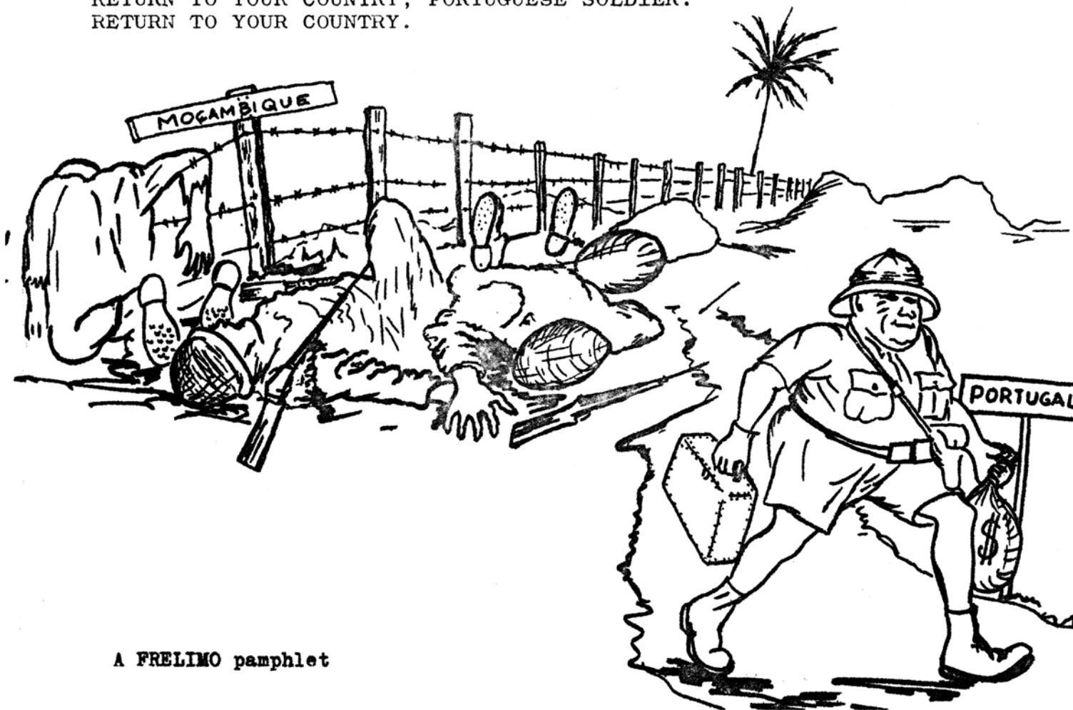
A FRELIMO pamphlet

REFUSE TO FIGHT IN THIS UNJUST WAR. SAVE YOUR LIFE, SAVE YOUR HONOUR WHILE IT IS TIME. RETURN TO YOUR COUNTRY, PORTUGUESE SOLDIER. RETURN TO YOUR COUNTRY.