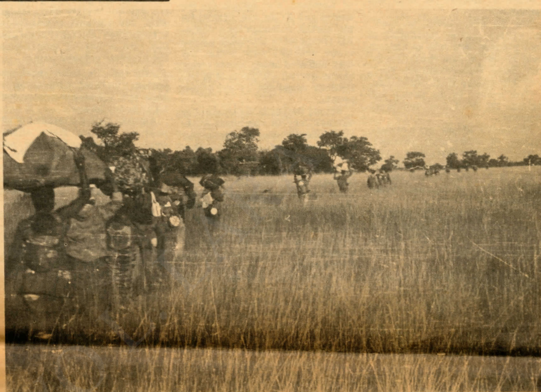
Women taking supplies to the guerrillas.