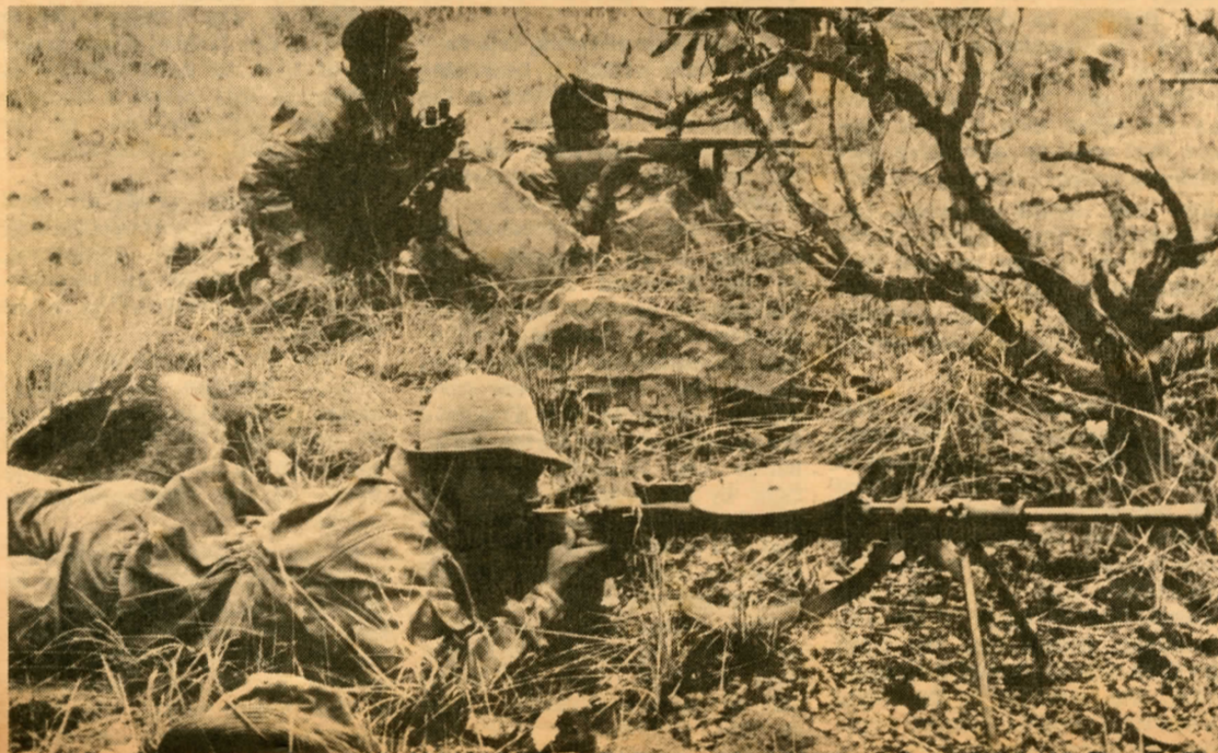
Supporting ambushed comrades.

We have divided the country into six politico-military regions and we are fighting in five of them, one of which is entirely under our control. By setting up schools there, helping the peasants to develop production and providing minimal medical