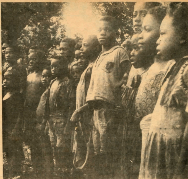
Children in the guerrilla area.