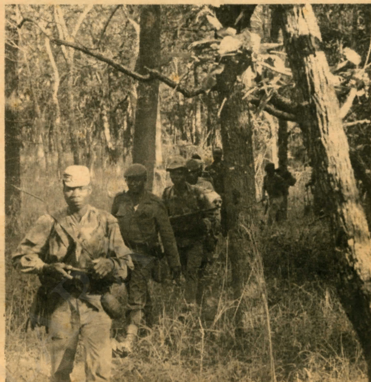
Dr. Agostinho Neto, President of the M.P.L.A. 2nd from the front inside Angola.

The situation in South East Asia, especially in Indochina, where the heroic resistance of the Vietnamese people against US aggression stands out with vigour and beauty, as well as the struggle of the peoples of Cambodia and Laos and also Korea, the struggle of the Palestinian people and the Arab peoples against Israel's aggression, the struggle of the Latin American peoples against regimes submissive to American imperialism, and also the demands