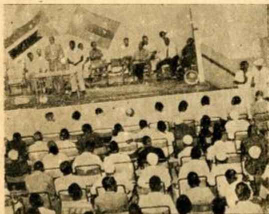
Picture shows Dr. Eduardo Mondlane announcing resolution passed by Congress. And seated are Party Representatives from abroad and branch leaders from Tanganyika and Mozambique.

PROCLAIMS the unity of all Mozambicans without any distinction of tribe, class, religion, ideology or sex, in the fight, for the immediate and complete liquidation of Portu-