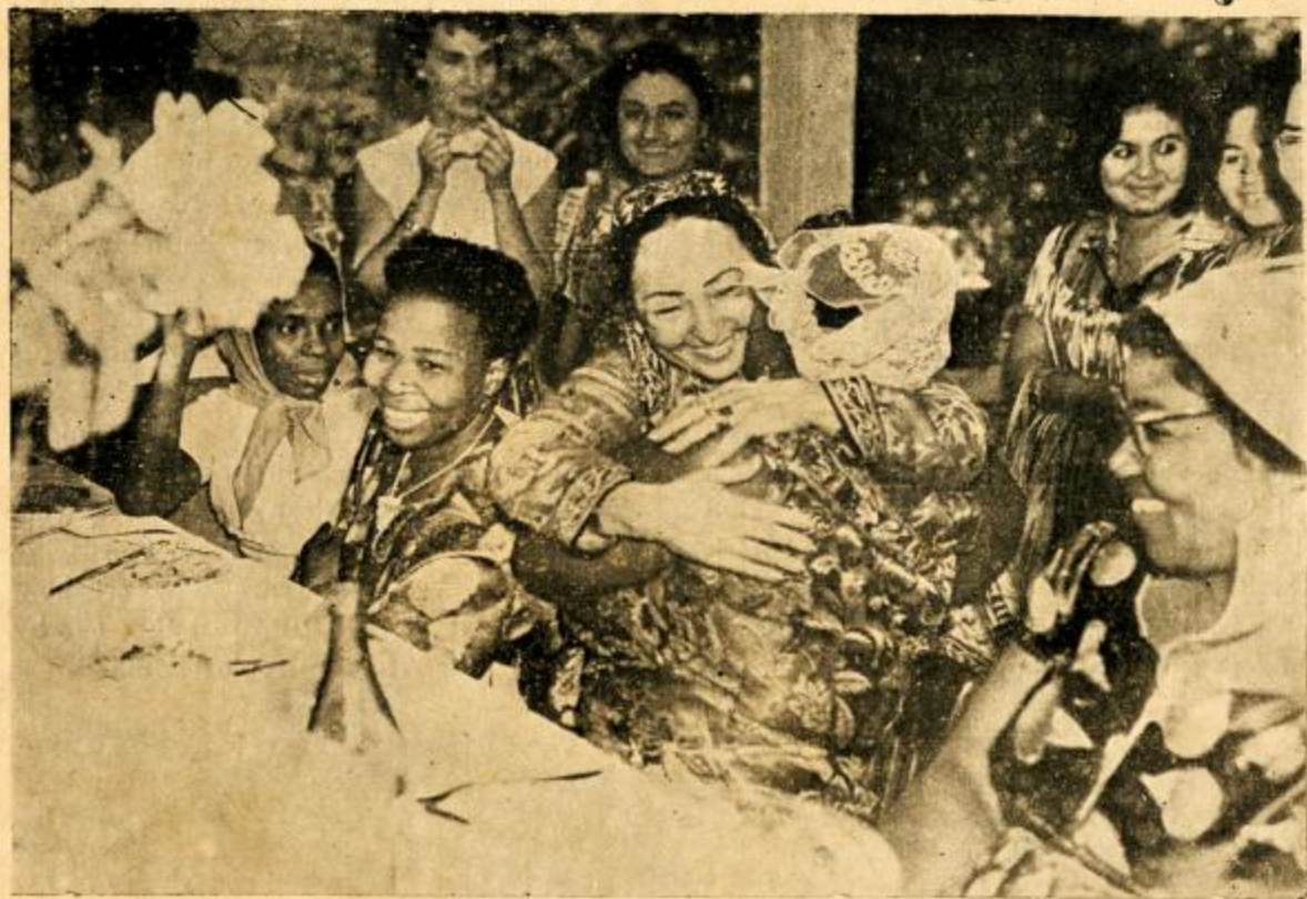
SOLIDARITY AMONG THE AFRO-ASIAN WOMEN HAS BECOME A MUST.