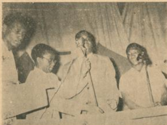
Third from left is Dr. Eduardo Mondlane the National President of FRELIMO addressing 1st Party Congress "Mozambique is not mine but ours".

In his opening speech at the Congress, Dr. Mondlane said: "For quite a long time we