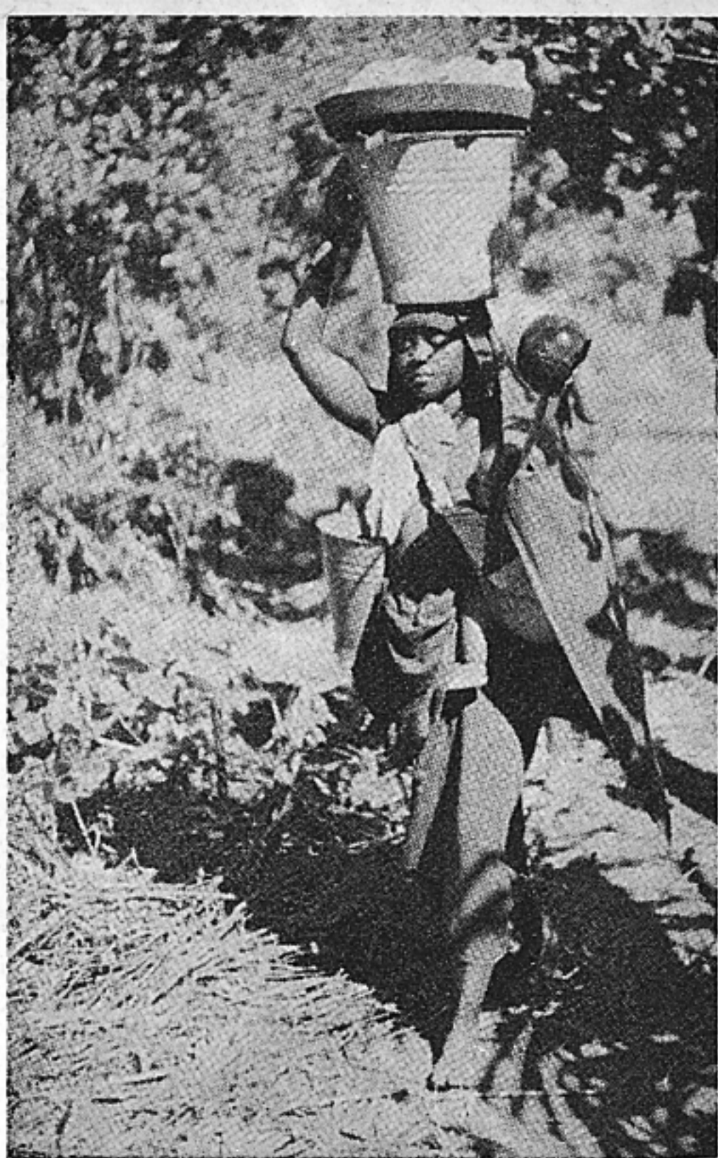
Mozambican women in the liberated zones of Mozambique work hard in the present difficult conditions for the freedom they know is coming.

Although the Portuguese concept of an "Overseas Province" is that it is part of the mother country, and therefore its inhabitants should have rights equal to any Portuguese, they