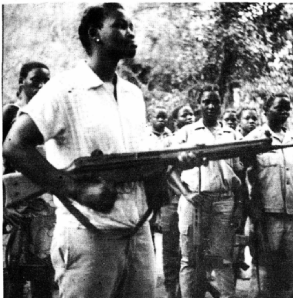
Frelimo Women militants

Well, there was no more tax to pay, but where to get clothes, where to get soap? In 1965 we had not yet made provision for this. But the fighters had a good understanding of the situation and this was natural because they were forced to have this full comprehension of the problems. They understood that in the fight against the Portuguese they had to kill the soldiers or they would be killed; they were also forced to discuss and understand what relation they should have with the people.