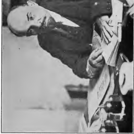
LENIN AT HIS DESK IN KREMLIN