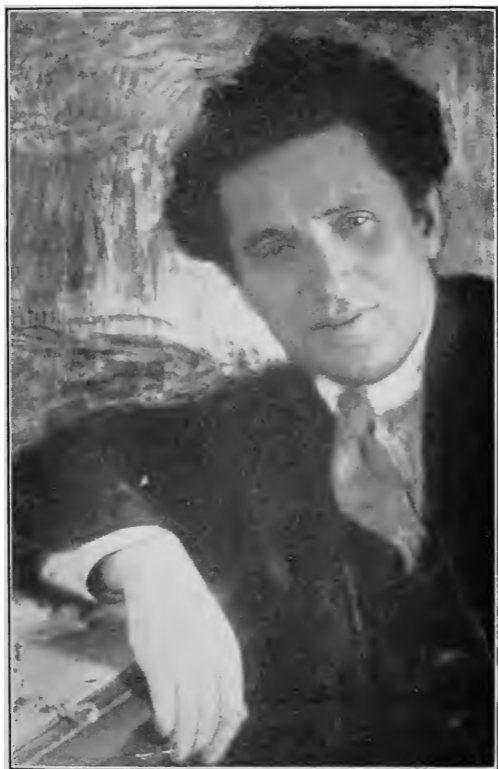
ZINOVIEFF President of the Petrograd Soviet