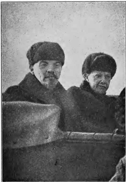
LENIN AND MRS. LENIN, MOSCOW, 1919