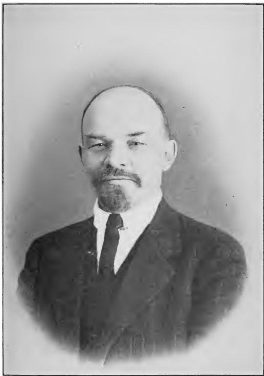
LENIN IN SWITZERLAND, MARCH, 1916