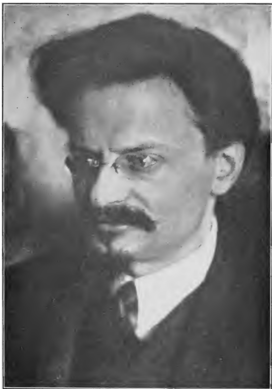
TROTZKY Commissar of War and Marine