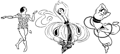
Droshkys, Dancing the Ktemlin