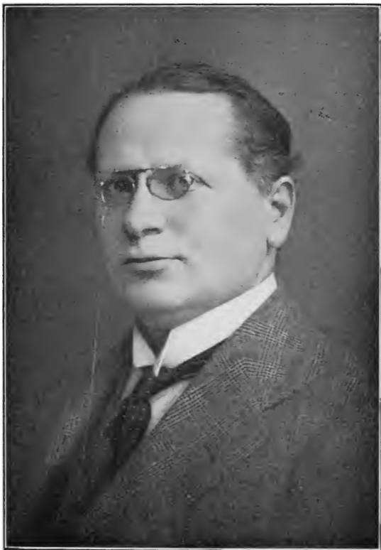
LITVINOFF Assistant Commissar of Foreign Affairs