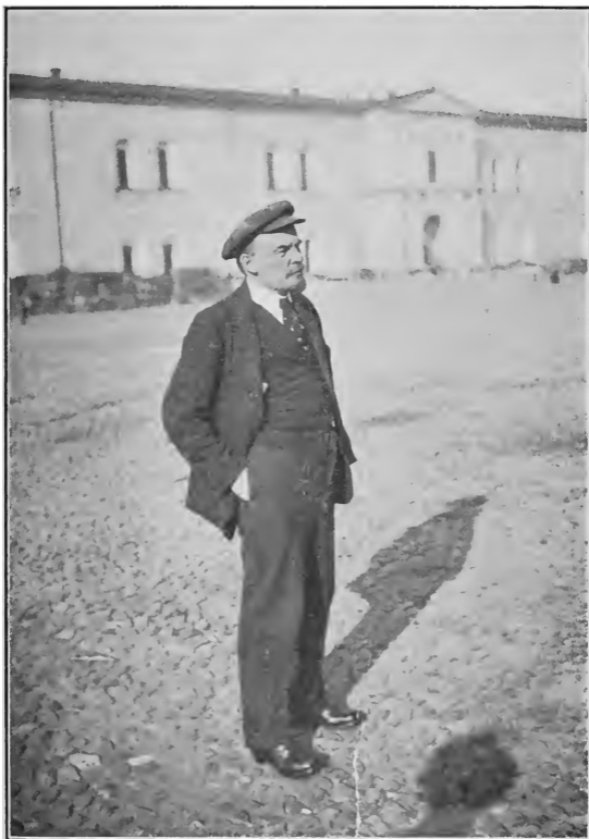
LENIN IN THE COURTYARD OF THE KREMLIN, MOSCOW, SUMMER OF 1919