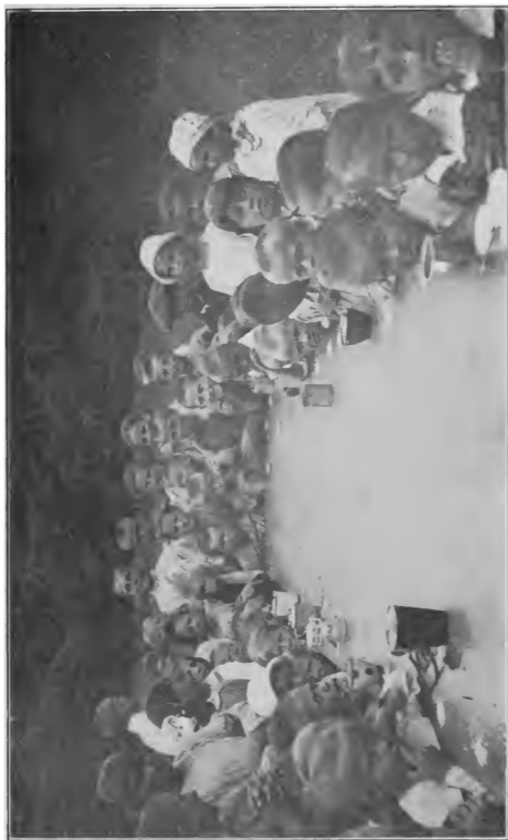
CHILDREN OF THE SOVIET SCHOOL, AT DIETSKOE SELO Formerly Tsarskoe Selo, the residence of the Czar