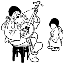
A Samovar, Playing on his Ukraine