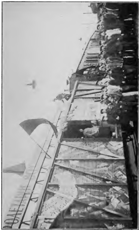
ONE OF THE MANY TRAINS CIRCULATING SOVIET PROPAGANDA THROUGHOUT RUSSIA