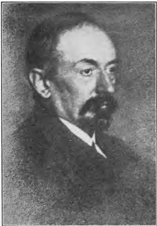
CHICHERIN Commissar of Foreign Affairs