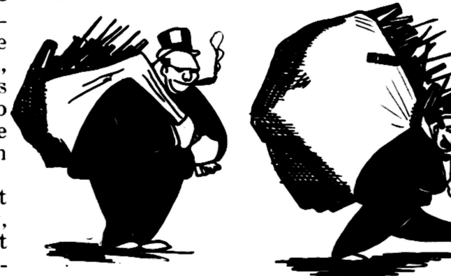
Left: The bosses delegates with baggage go to London Naval Parley. Right: The baggage of the bosses when they return.

Twelve years have passed in the life of the Red Army. In the second year of the Five-Year Plan it has had to guard the peaceful industry of our Union even more vigilantly than ever. The Chinese imperialists have attacked the peaceful construction of our Union. True to their peace policy, the Soviet Government attempted to settle the conflict, but the Chinese generals began warlike actions, and the young fighters of our Red Army, with mighty blows, had to compel the imperialists to take their hands off the borders of our Union.