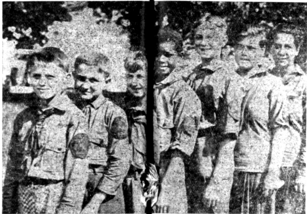
First Workers Children's Delegation from the U. S. A. to the U. S. S. R.