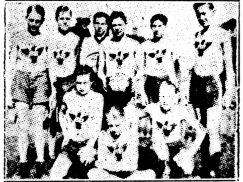
Black Hawks Jyry A. C. of Conneaut, O. Junior Champs of Pa.,-Ohio Dist.

school group teams. There will be two tournaments. When we finish the first, in which only those clubs which have their teams ready by Nov. 4th can play, we will play another tournament. In the second tournament, all pioneer sections, all pioneer groups which will have teams were not read when the first tournament started, will be able to enter the second time.