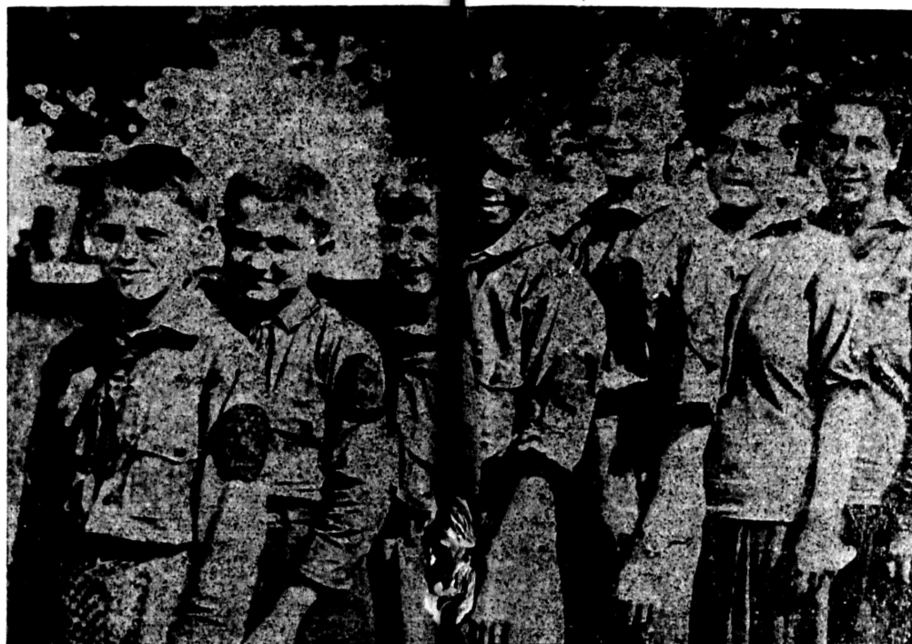
First Workers Children's Delegation from the U. S. A. to the U. S. S. R.

Many are the accomplishments of the Societ workers. The factories, the lands, the houses belong to the workers and the peasants. The worker have the seven-hour day, receive a month's vacation with pay, have social insurance for unemployment, sickness etc. The youth works six hours a day, five days a week. At the age of eighteen they have the right to vote.