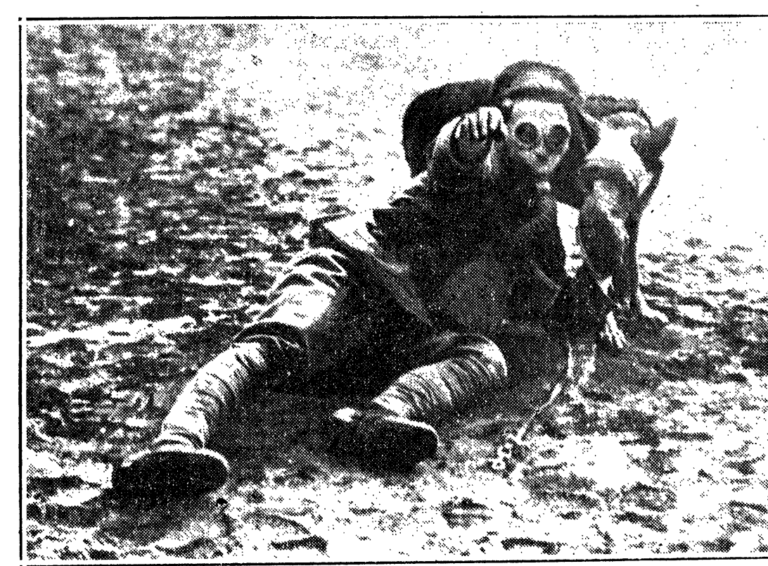
A large part of humanity was outraged when Darwin suggested that human beings evolved from monkeys. Far better cause for indignation is the growing tendency of mankind to develop into beasts of bloodshed and destruction as pictured above.

The discarded hulk of capitalism in its dying fevers is prepared to breathe poison gas. The Japanese soldier above may think that his mask will afford him some security. But no mask can defend against the gasses invented since that last war. The only defense is for the populations of nations to organize and prevent the capitalist powers from releasing the destructive fumes.