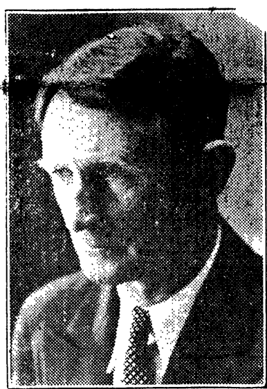
His cell was looted.

raids on the Reds. Besides, their superiors might "dump" them if they said they had NOT given an order to raid Mooney's cell.