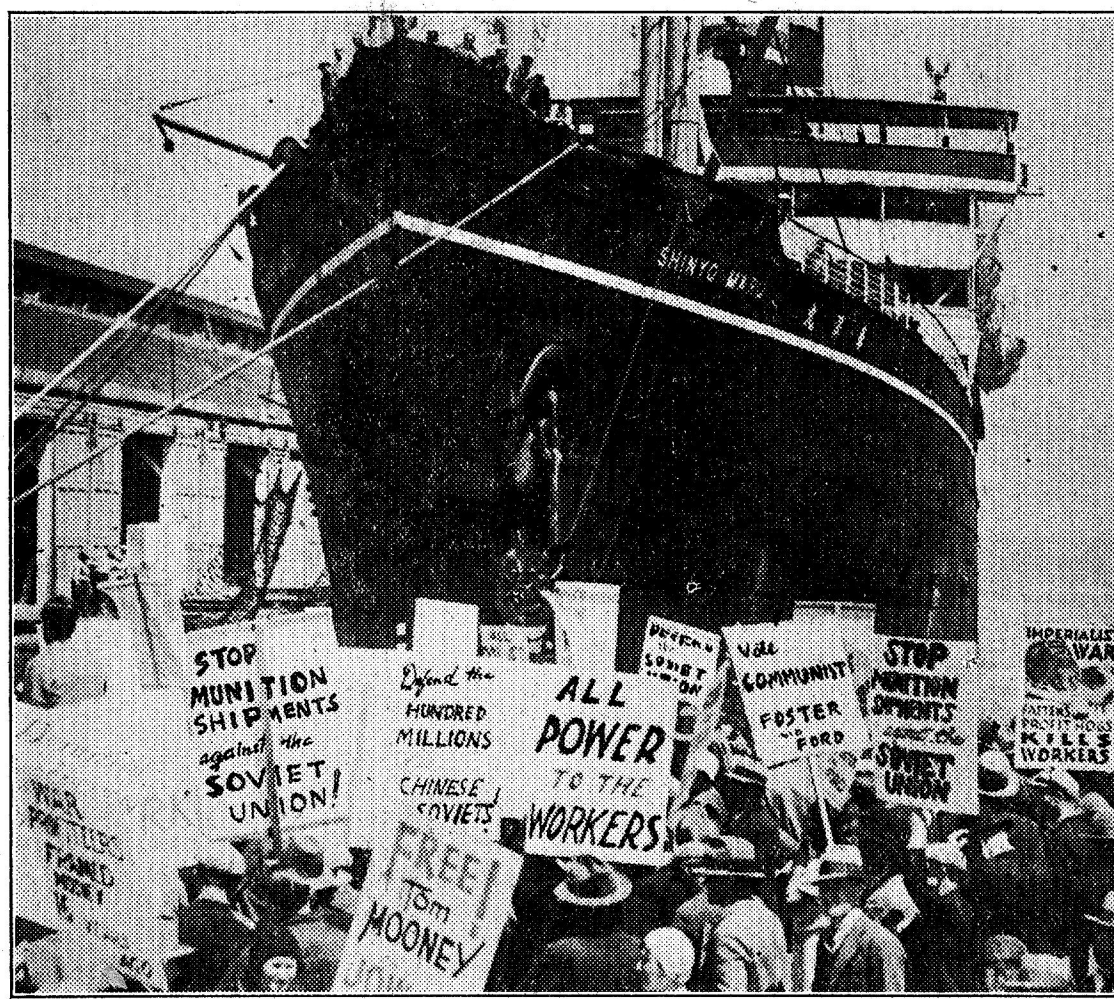
San Francisco Workers demonstrate at Pier 34, where the Japanese "Shinyu Maru" was loading lead for munitions. Sailors on board looking down were not permitted to go on shore.