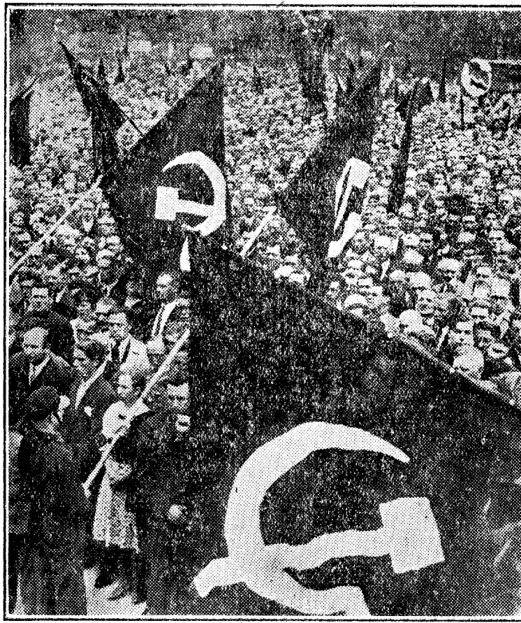
German Workers Demonstration under the leadership of the Communist Party during election campaign.