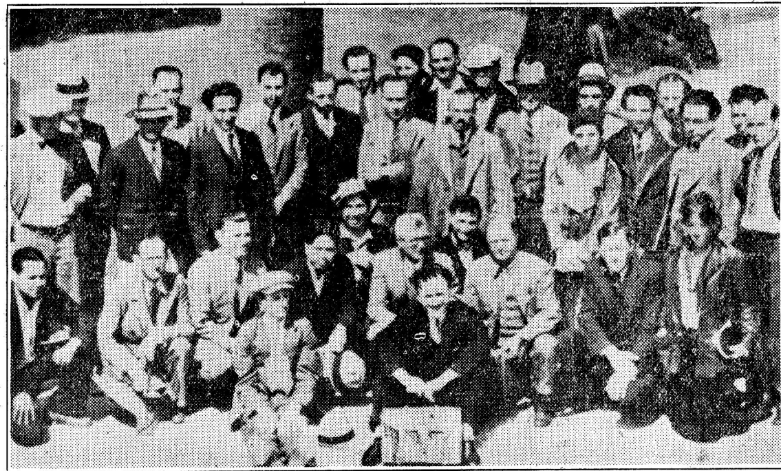
Defendants of the Long Beach trial, whom the Southern California bosses tried to railroad to prison on charges of "attempting to commit criminal syndicalism." Ten of the workers are still in jail, held under prohibitive bail, facing deportation to fascist countries.

For the purpose of selecting a delegation to appear at the hearings called by the California State Unemployed Commission on April 27 and 28 in San Francisco,