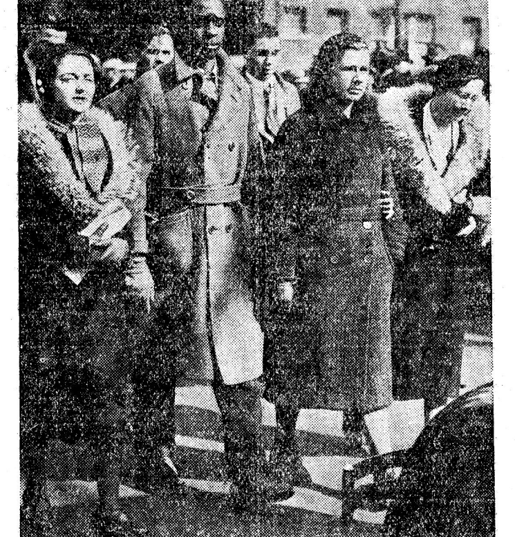
Part of the great mass funeral for the four jobless workers who were murdered by gunmen of Henry Ford and Mayor Murphy of Detroit when a demonstration of unemployed were attacked before Ford's Rouge River Plant.