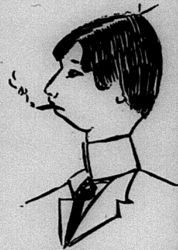
"AFFIDAVIT" VAN DUYN

Resolved, That this convention shall nominate a candidate of the party for United States senator, and that we hereby pledge the good will of the party to the election of such candidate by the legislature, and that all candidates for the legislature, whether the same shall have been heretofore nominated, are hereby pledged to the election of the candidate of the party nominated in this convention.