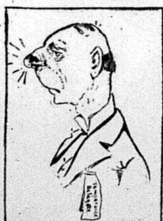
"We must change human nature before Socialism is possible."