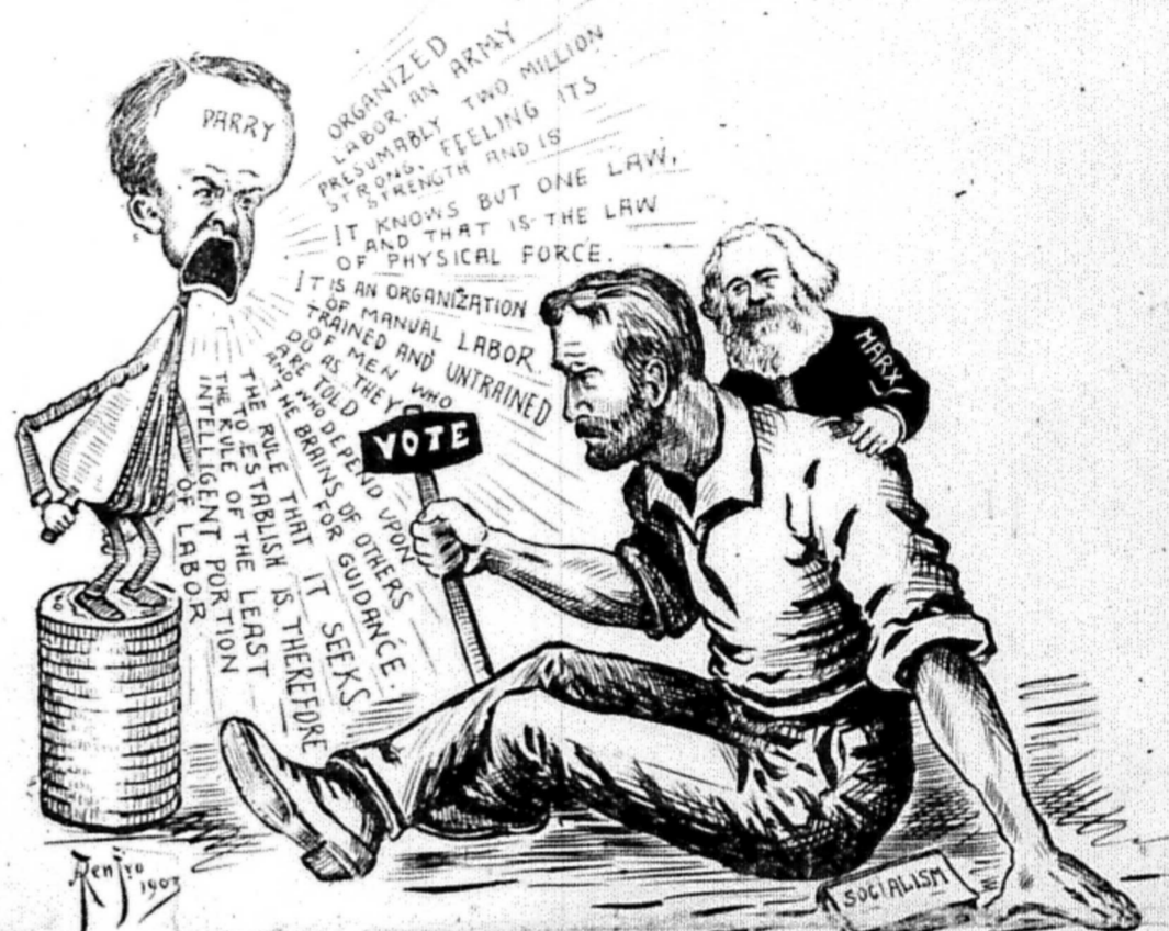
THE PIGMY AND THE RISING GIANT

Translation: A Pair o' Bellows against a Giant