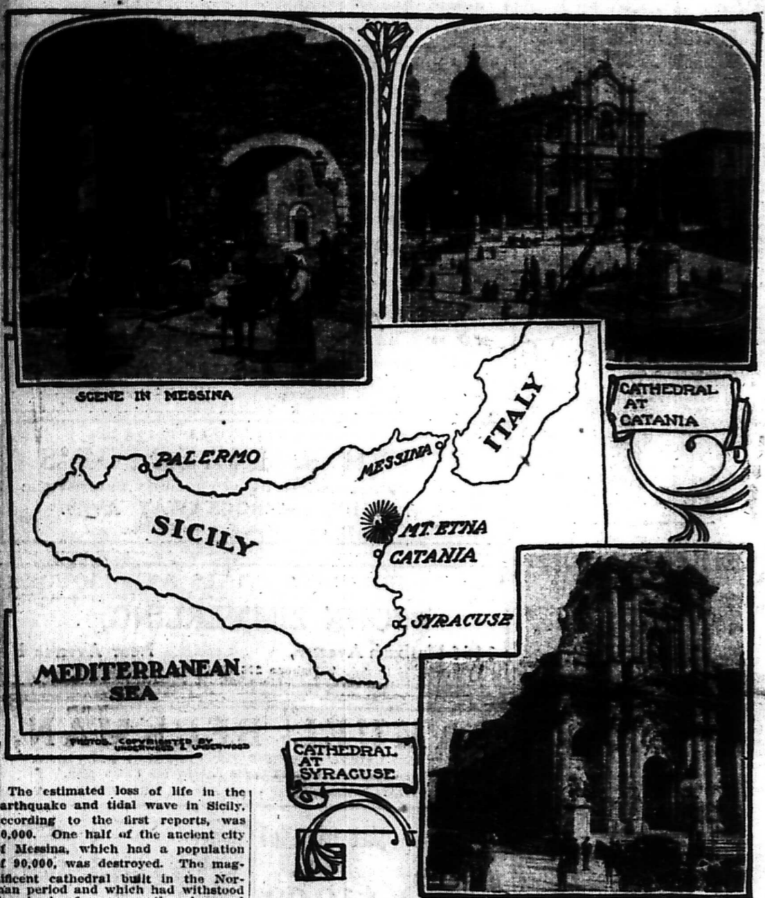
The estimated loss of life in the earthquake and tidal wave in Sicily, according to the first reports, was 20,000.