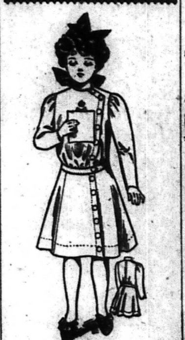
GIRL'S DRESS. Paris Pattern No. 2676. All Seams Allowed.

Hunter-green Venetian cloth has been developed in this stylish model, which is distinctly new in both cut and outline. The waist portion is made with two tucks at the center-back and is slightly gathered at the waist-line.