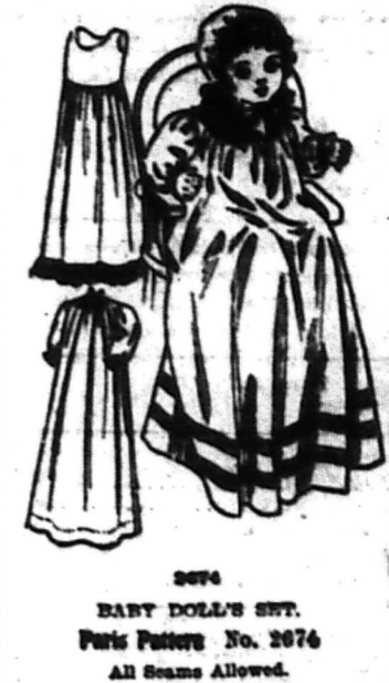
Consisting of a dress, petticoat, slip or night gown, and one-piece cap, this is a simple little set for the baby doll.