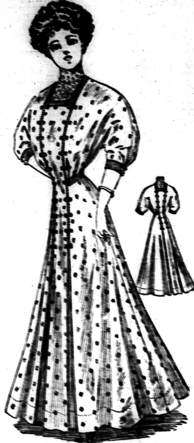
602—Forsythe Court, 24 to 26 East... PRINCESS GOWN 602.