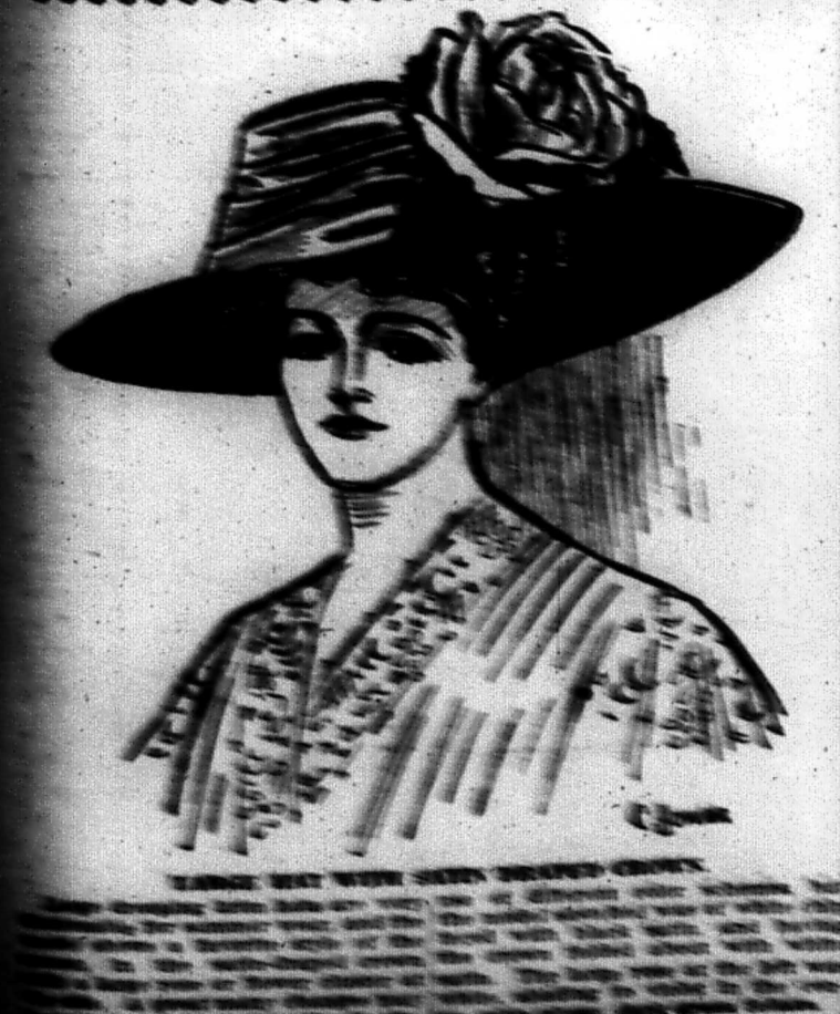
THE CHANGING STYLE. The new style in hats and dresses.

BOOTS AND SHOES. Wear the NEW A SHOE $2.50.