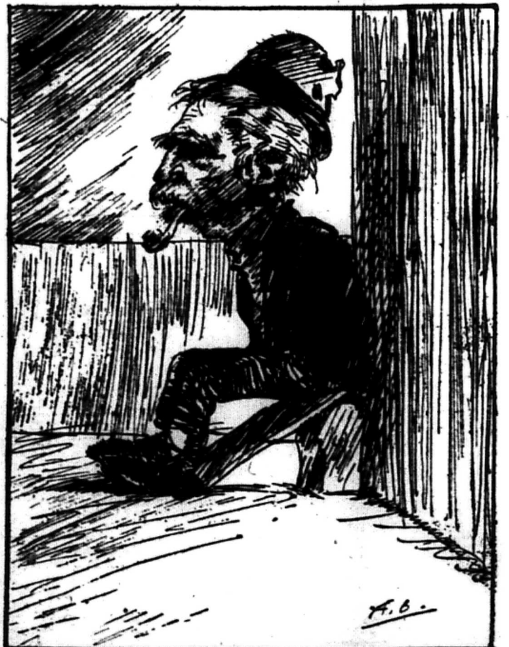
IF H. H. ROGERS SHOULD EVER GET "HIS" HANDED TO HIM: WHAT THEN? THIS! MAYBE