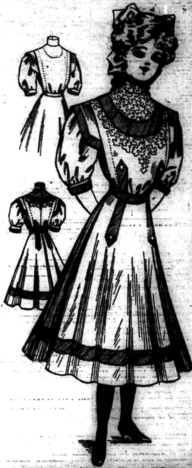
6035—Girl's Dress with Circular Skirt, 8 to 14 Years.