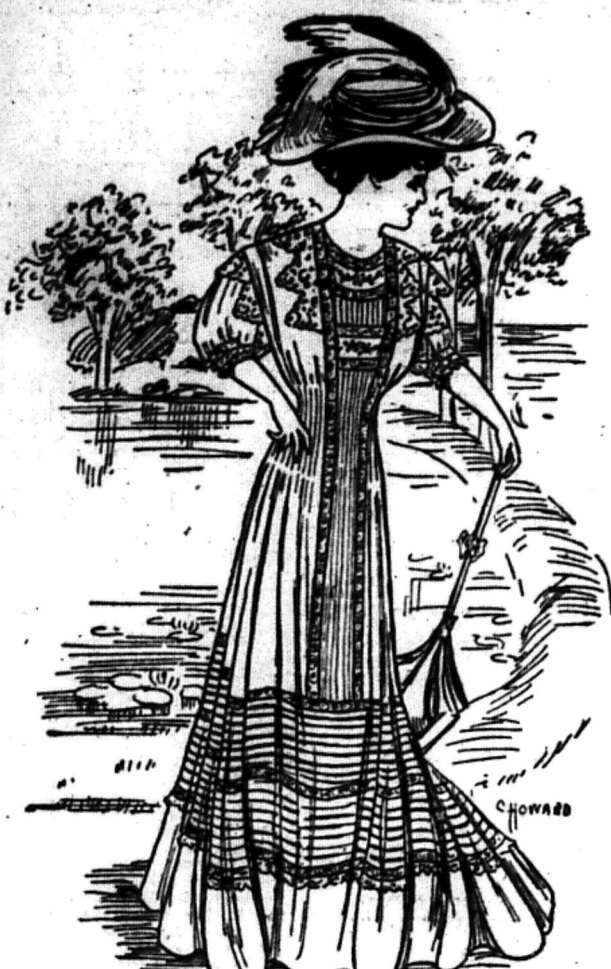
LINGERIE PRINCESS GOWN.