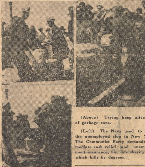
(Above) Trying keep alive out of garbage cans.