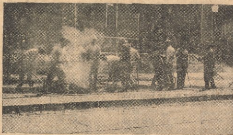
Below, a chain gang at work on a street in America. Here, not only are there 10,000,000 unemployed, but you are thrown on the chain gang for not being able to find a job! Where is there forced labor and starvation?