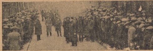
A breadline in New York last winter. They will be larger this winter all over the country. Workers don't stand for it! Organize, Fight for social insurance