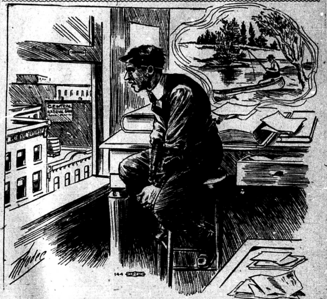
A Prisoner of Capitalism—A Tragedy of Spring!