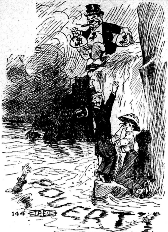
It is Reaching the Middle Class

Where The Herald goes, Socialism and Socialist organization grows. Send in your subscription, and keep your eye on Milwaukee and the grand march of the Socialist movement throughout the world.