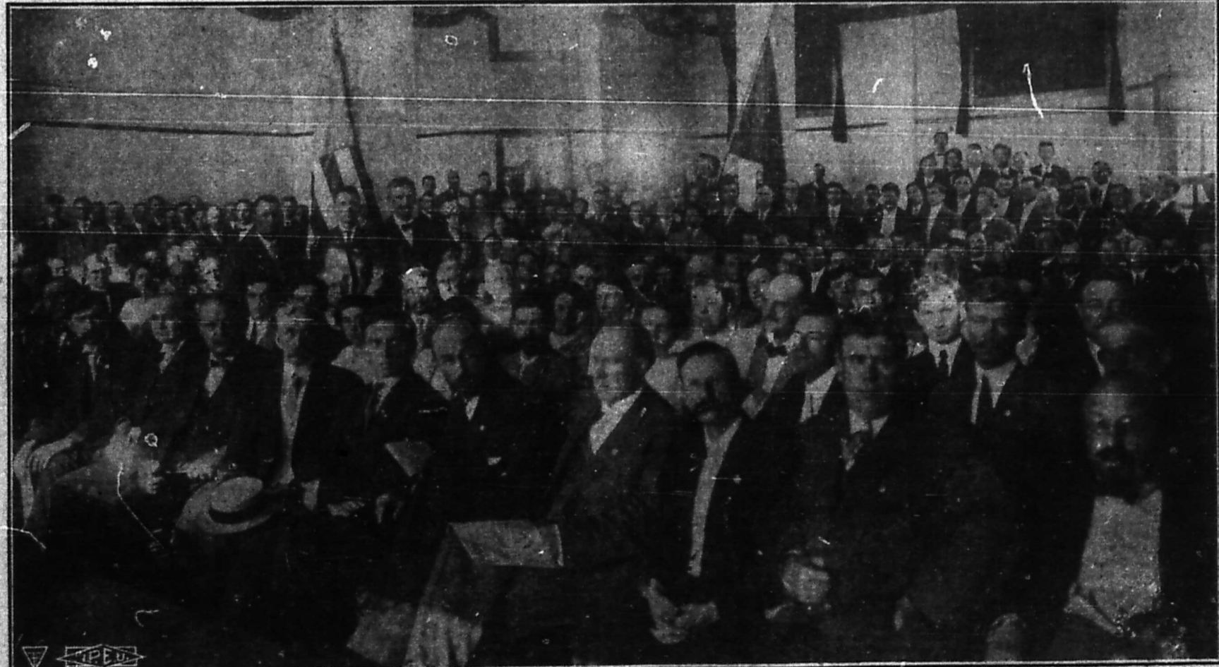
The above photograph was taken the first day of the session and gives some idea of the attendance in Brisbane hall. While many of the faces are too small for identification here it may be mentioned that in the first row, looking from right to left, the first figure is that of the editor of the Jewish Labor World, published in Chi-