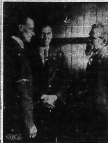
Three Socialist Mayors.

Berger's Pension Bill Rochester (N. Y.) Herald: Congressman Victor Berger's bill to give a pension of four dollars a week to every person in this country who has reached the age of 60, will not pass congress, but it may set many people to thinking. The time was when no body would have thought of an old-age pension bill in connection with America. Poorhouses have always been maintained, but the folks who went to them were always despised, and they were often treated as badly as if they were in prison, convicted of crime. Today the claim is made that after a man or a woman has reached a certain number of years, he or she is entitled to a reward for the years spent in serving the community through toil. The growth of poverty among us since the Civil war has been startling. Before the Civil war, if there were not many millionaires, neither were there many paupers. The poorest, as a rule, possessed a rude plenty. But such is