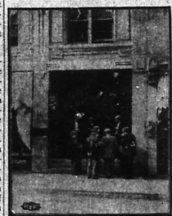
Entrance to Brisbane Hall.

first conference of Socialist officials in the United States has proved a success beyond expectations, so that the only ones who are mourning are the ones on the wrong side of the case—the old party politicians—and they got a jolt!