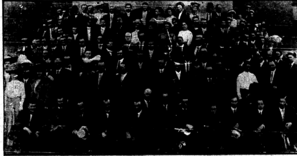
Group of Delegates at the Milwaukee Municipal Incinerator

ished and ought to be abolished. But you saw what happened in England lately. They have shorn the house of lords of its power. The same thing is going to happen to the United States senate."