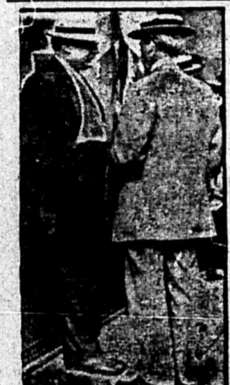
Victor L. Berger buttonholed by a Milwaukeean.