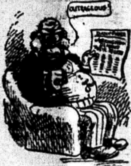
Capitalist: "Workmen demand their rights. Organized labor will get an injunction!"

in September. A banner for Labor Day had been ordered to cost about $55. Report accepted.