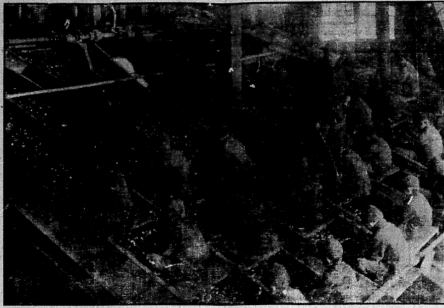
Engraved from a photograph secured by The Social Democratic Herald from the Scientific American, New York.