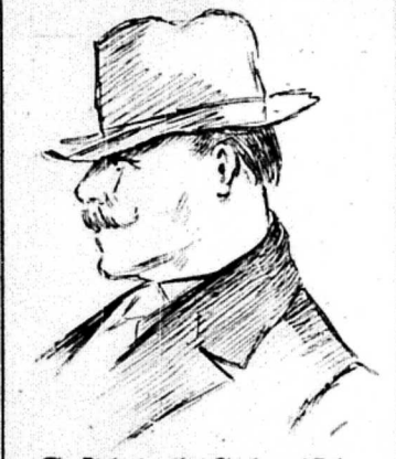
The Pinkerton that shadowed Debs. (Sketch for Herald by Father Hagerty.)

Cigarmakers' International Union. No. 25 office and employment bureau, 318 State Street.