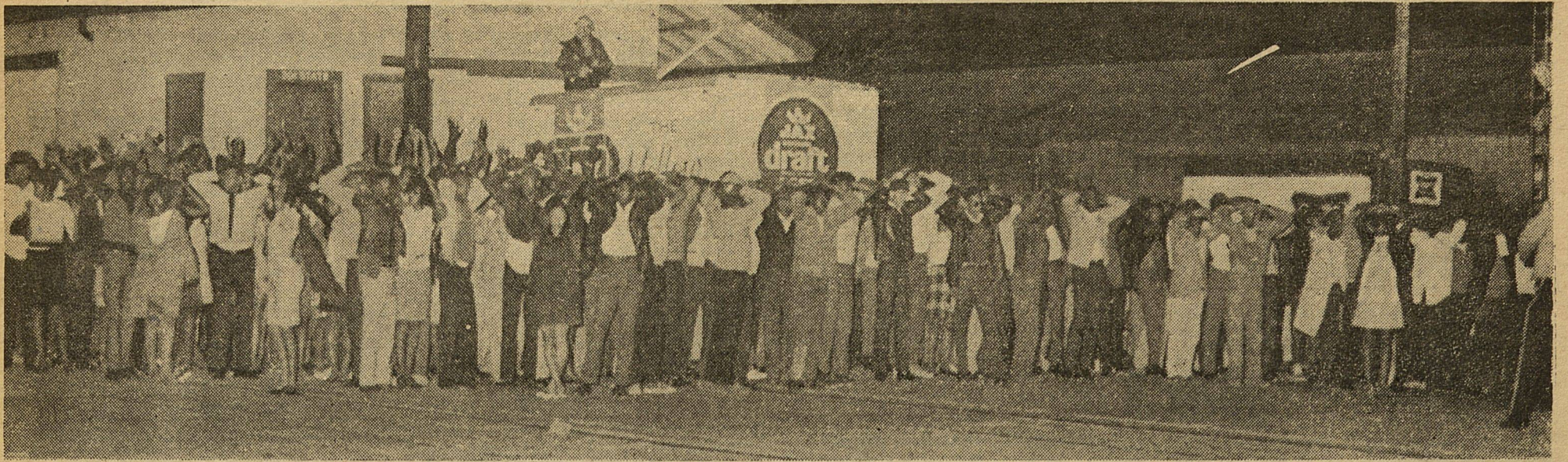
State troopers with shotguns guard the more than 200 young Negroes in a Pine Bluff dance Hall. Guard was also called in.