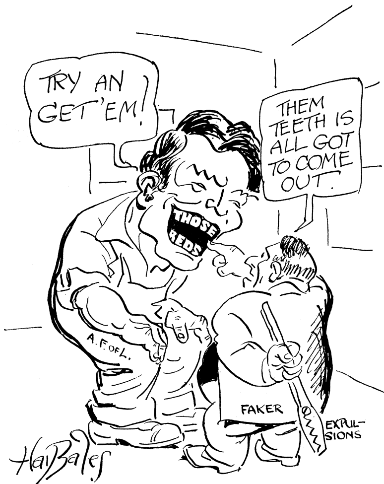
The Dentist Will Get His Fingers Bitten —By Hay Bales