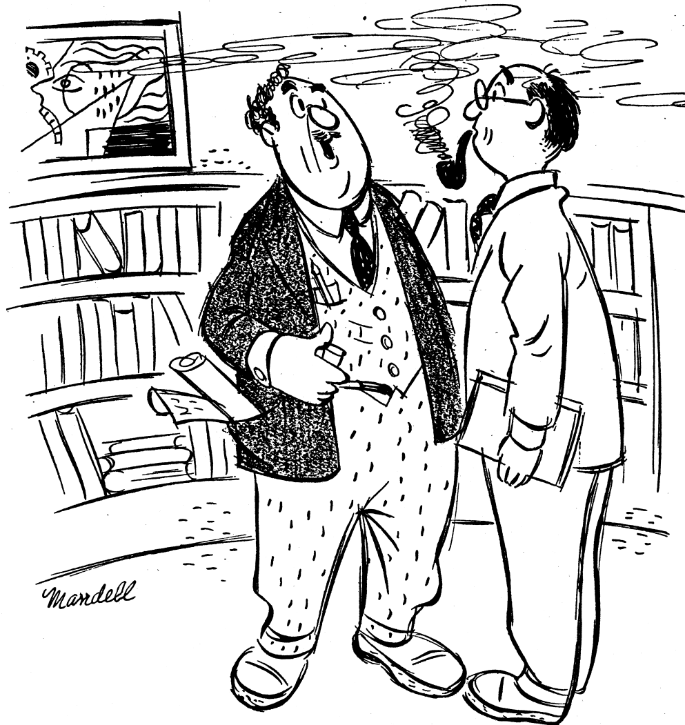
"I'll be glad when this war is over, so I can be a liberal again."

Such declarations prompted an official statement by the Mexican Communist Party: "Communist ideas are not 'strange' to Mexico. These ideas are born in all the countries in which exploited workers and peasants, Indian masses, and oppressed peoples exist. . . . Our Party has an immediate program that coincides . . . with the program approved in the PRM convention that decided to support the candidacy of Gen. Manuel Avila Camacho. Our support to that candidacy was always premised upon his acceptance of and compliance with that program. We did not support Gen. Avila Camacho for personal reasons,