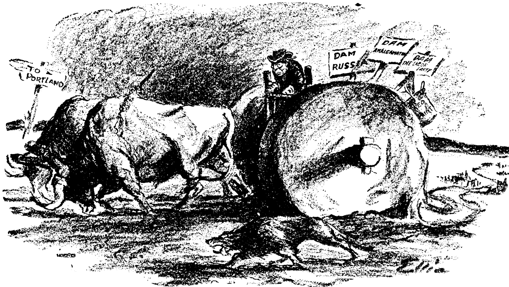
THE UNCOVERED WAGON.