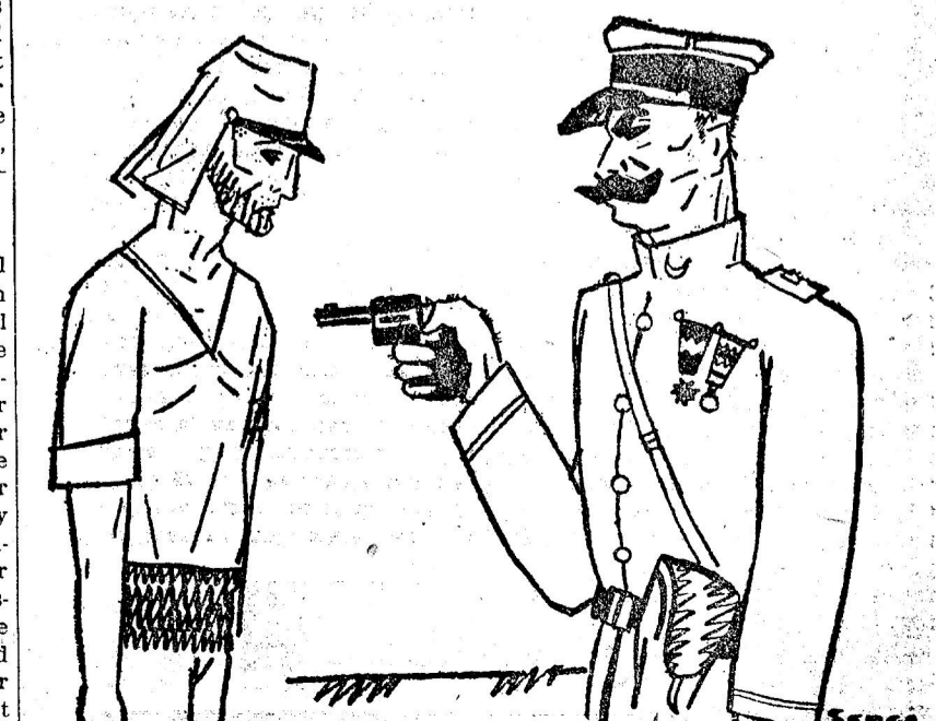
France Brings Civilization to Algeria.